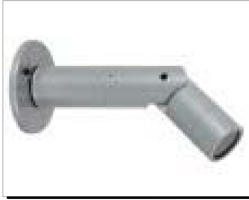
BK LIGHTING ARTISTAR WITH INTEGRAL TRANSFORMER AND ADJUST LUME SET AT 80%