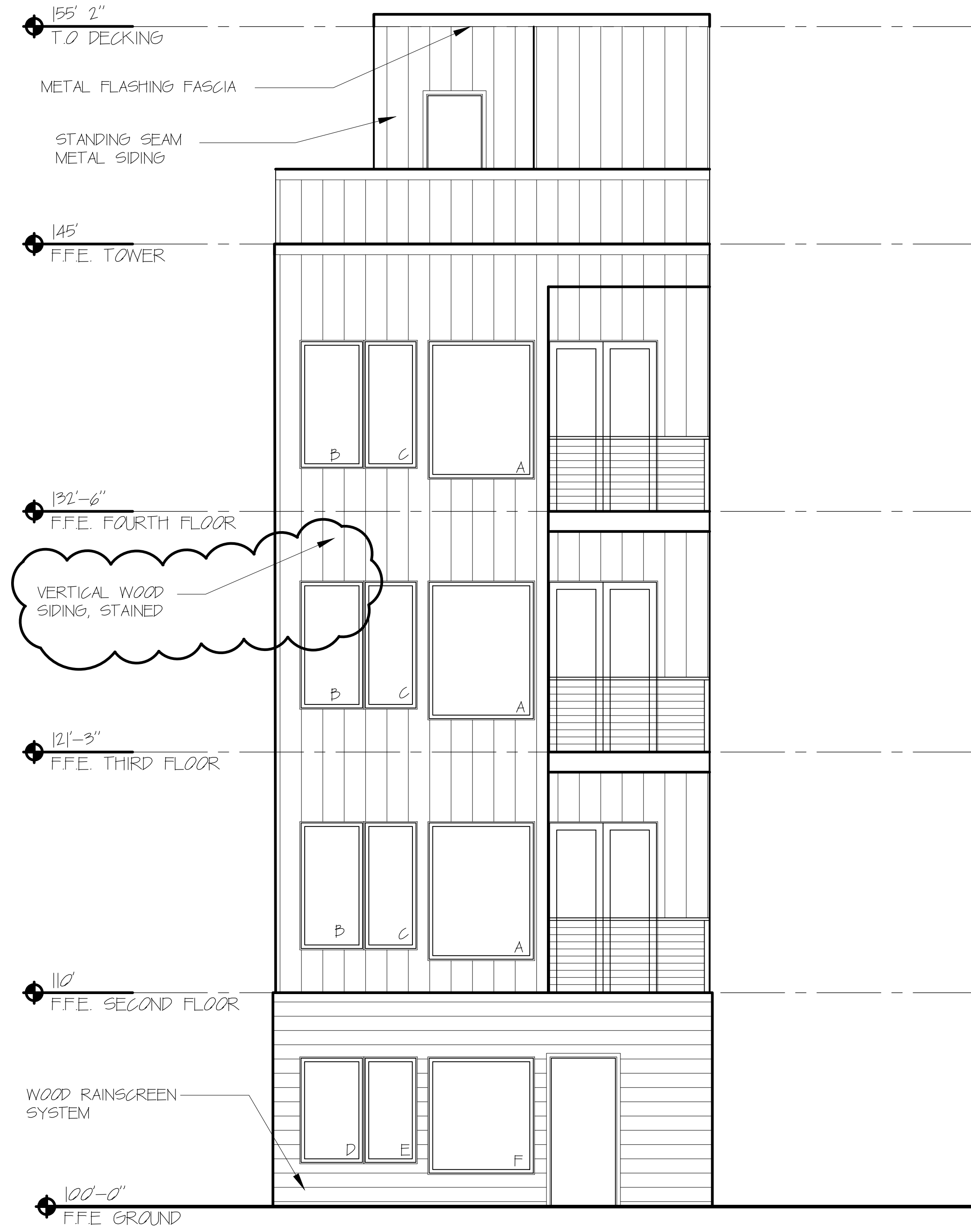
10 WEST ELEVATION SCALE: 1/4" = 1'-0"