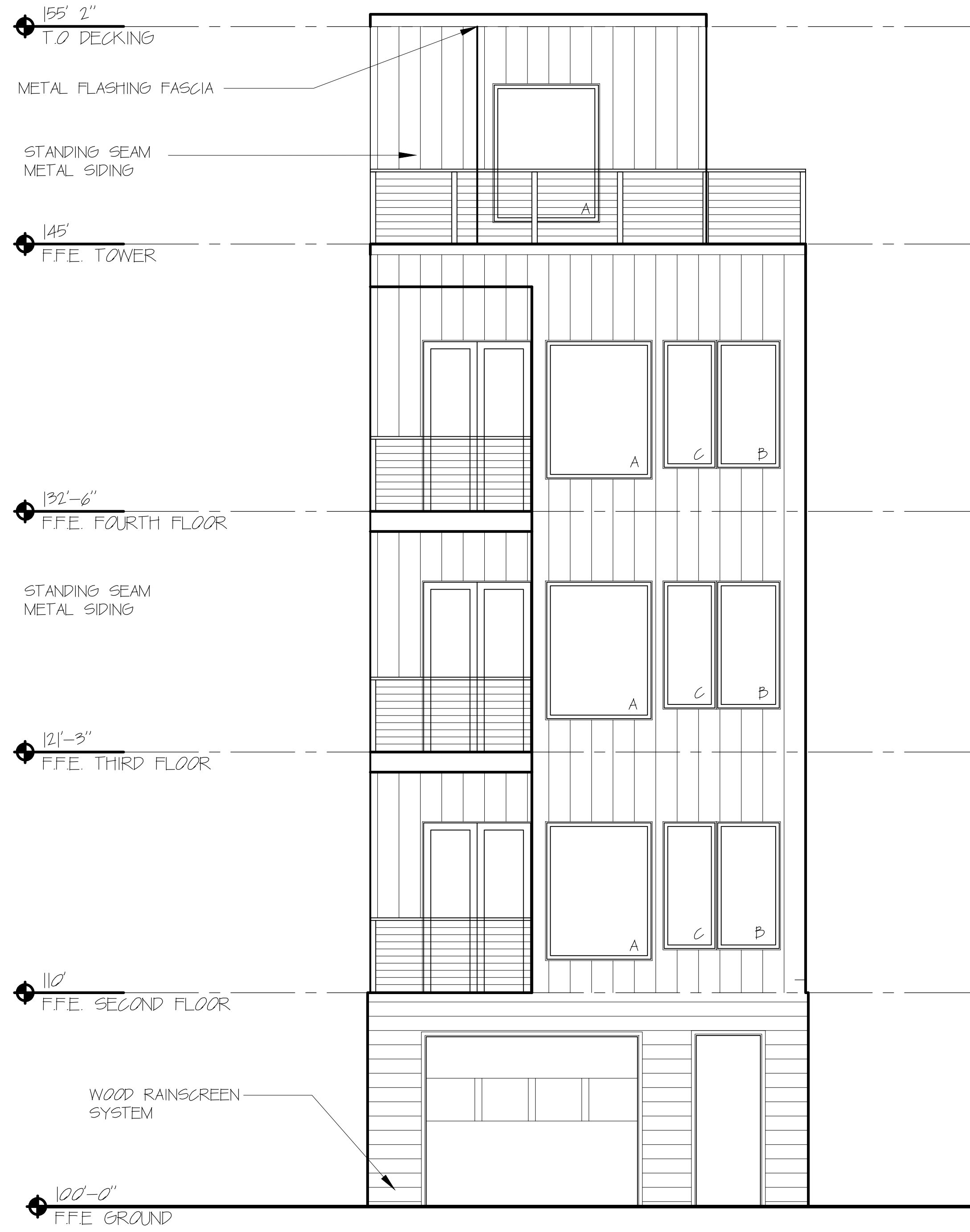
20 EAST ELEVATION 1/4" = 1'-0" SCALE: 1/4" = 1'-0"