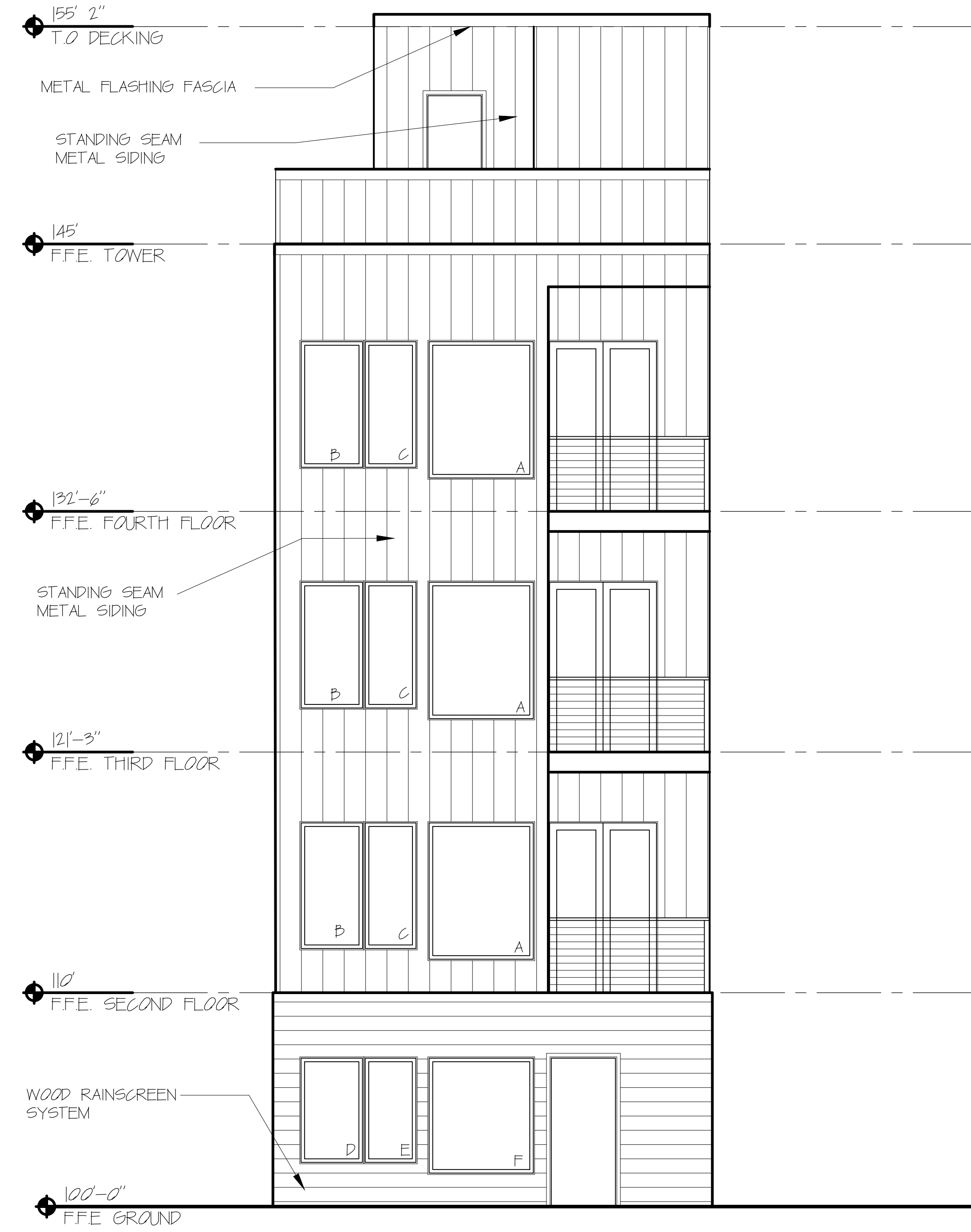
10 WEST ELEVATION 1/4" = 1'-0" SCALE: 1/4" = 1'-0"