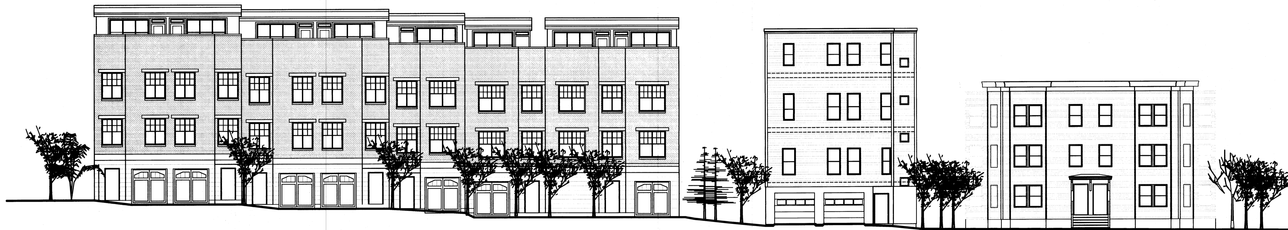
NEW 52 FEDERAL STREET BUILDING

K:\FMC Projects\11-0000 - 92 Federal\RNDR\92 Federal 14.jpg