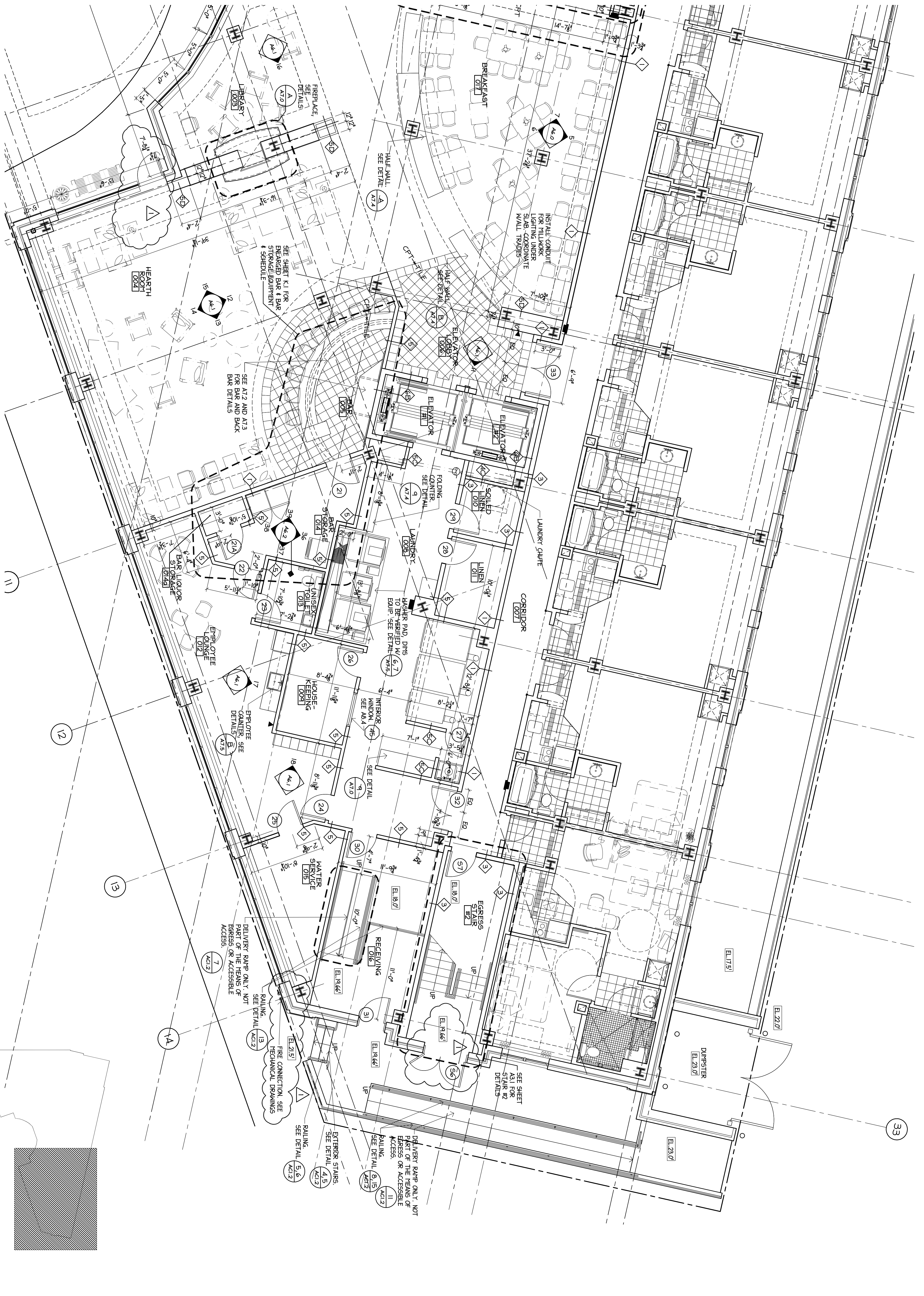
1 ENLARGED FIRST FLOOR PLAN 3/16"=1'-0"