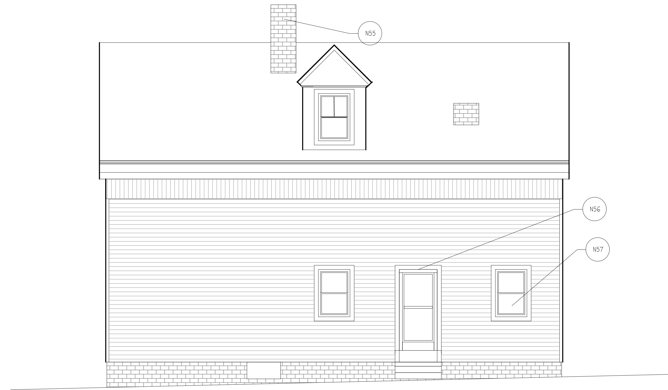
2 EXISTING DRIVEWAY (RIGHT) ELEVATION SCALE: 1/4" = 1'-0"

NOTES: N51. INSTALL SKYLIGHTS N52. PROVIDE NEW ROOF N53. REPLACE ALL WINDOWS N54. REPLACE FRONT ENTRANCE N55. REMOVE CHIMNEY N56. RELOCATE DOOR N57. RELOCATE WINDOW