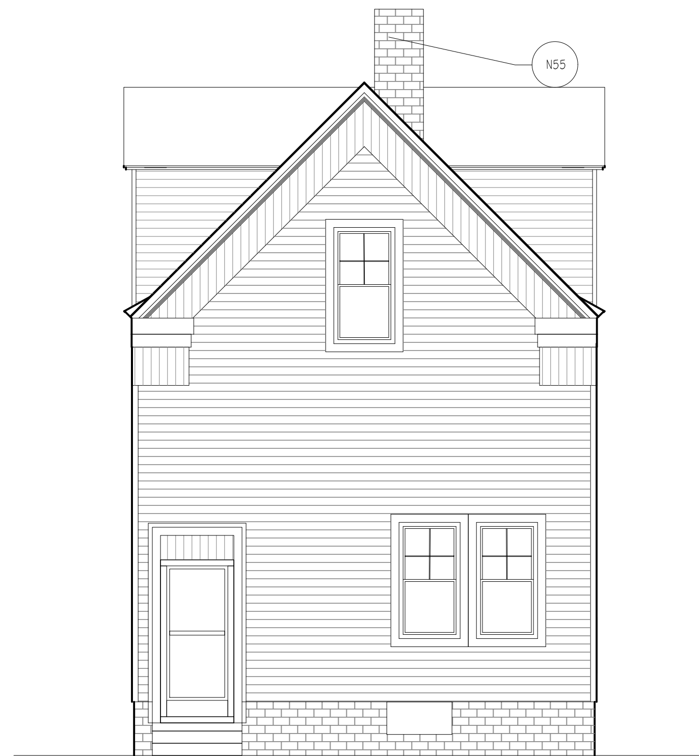
1 EXISTING STREET (FRONT) ELEVATION SCALE: 1/4" = 1'-0"

NOTES: N51. INSTALL SKYLIGHTS N52. PROVIDE NEW ROOF N53. REPLACE ALL WINDOWS N54. REPLACE FRONT ENTRANCE N55. REMOVE CHIMNEY N56. RELOCATE DOOR N57. RELOCATE WINDOW