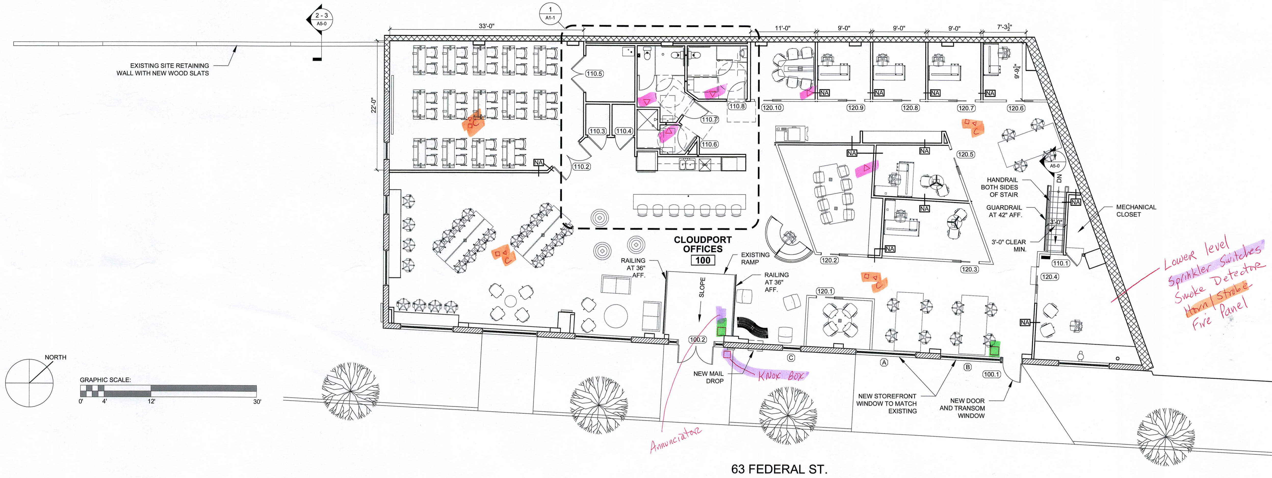
1 FLOOR PLAN 1/8" = 1'-0"