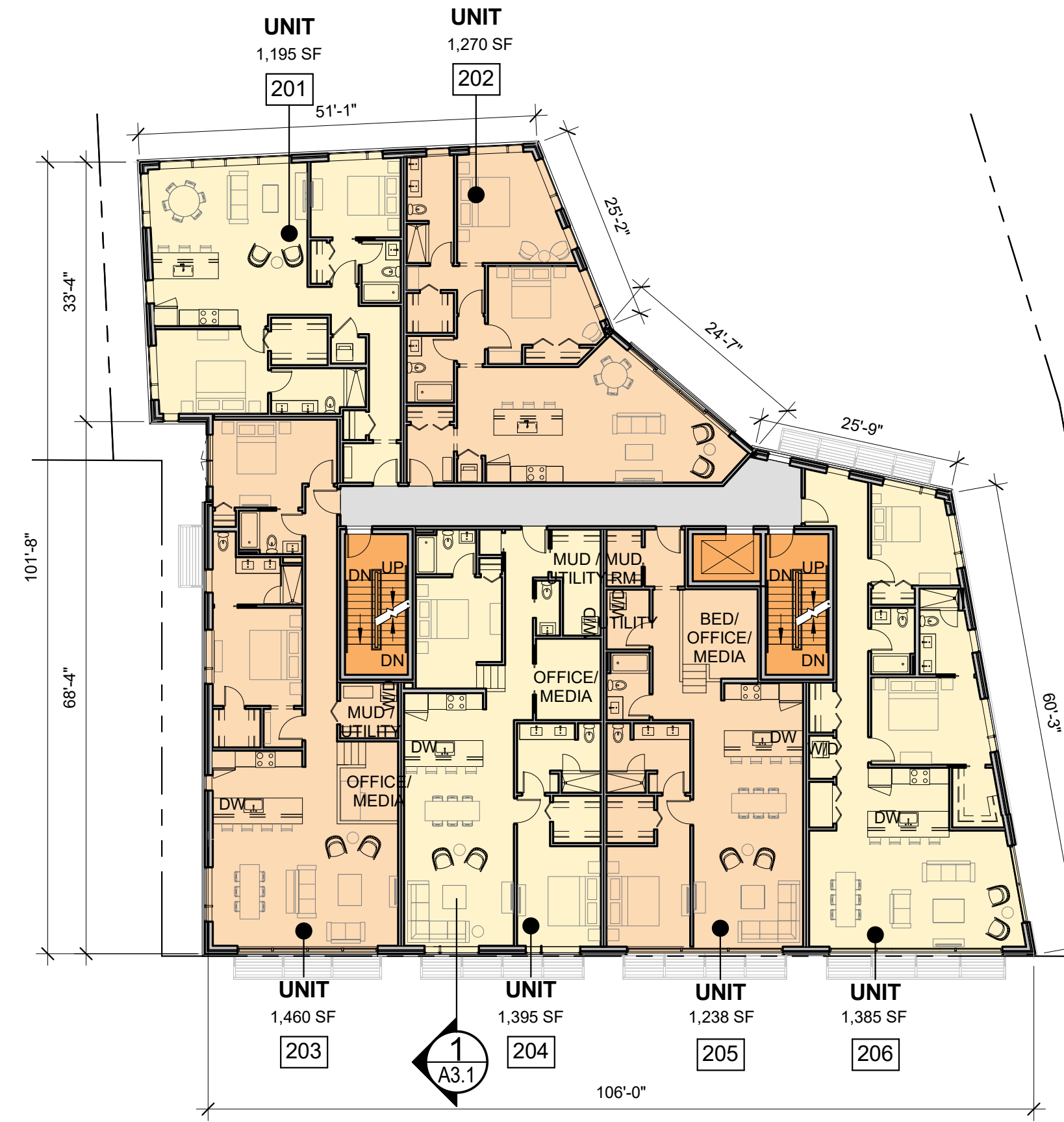
2 | 2ND - 5TH FLOOR 1/16" = 1'-0"