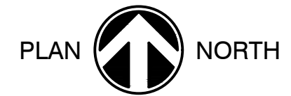
1 ELECTRICAL - Sixth Floor Fire Alarm Plan SCALE: 1/8"= 1'-0"

NOTES: 1. REFER TO UNIT ENLARGED PLANS FOR ALL FIRE ALARM WORK WITHIN UNITS (TYPICAL).