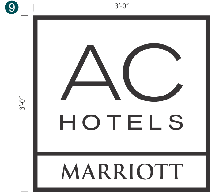
GRAPHIC DETAIL SCALE: 1" = 1'-0"

NOTE: EXACT WINDOW MEASUREMENTS TO BE FIELD VERIFIED PRIOR TO PRODUCTION