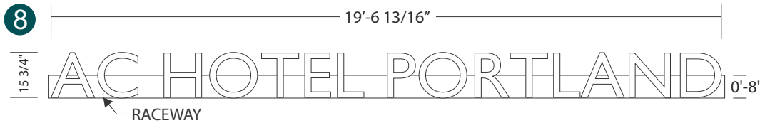
GRAPHIC DETAIL SCALE: 1/4" = 1'-0"