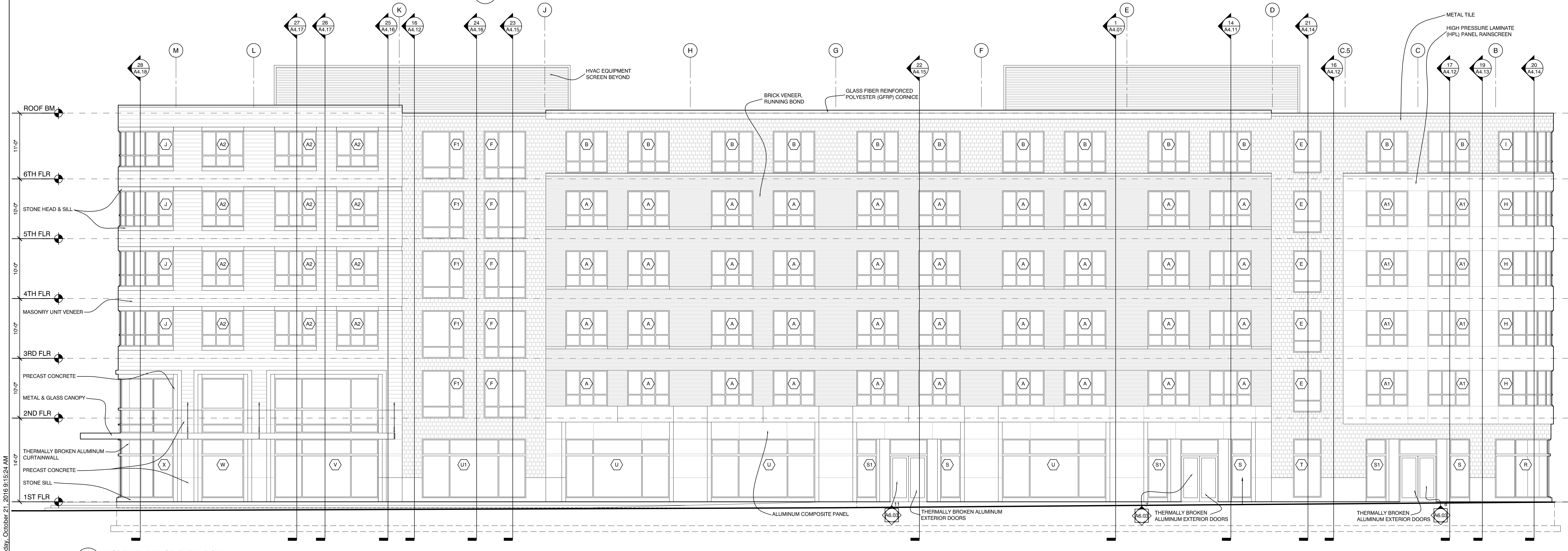
6 NORTH EXTERIOR ELEVATION 1/8" = 1'-0"