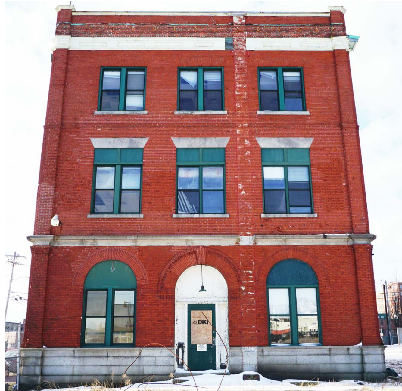
4 EAST IMAGE ELEVATION NTS