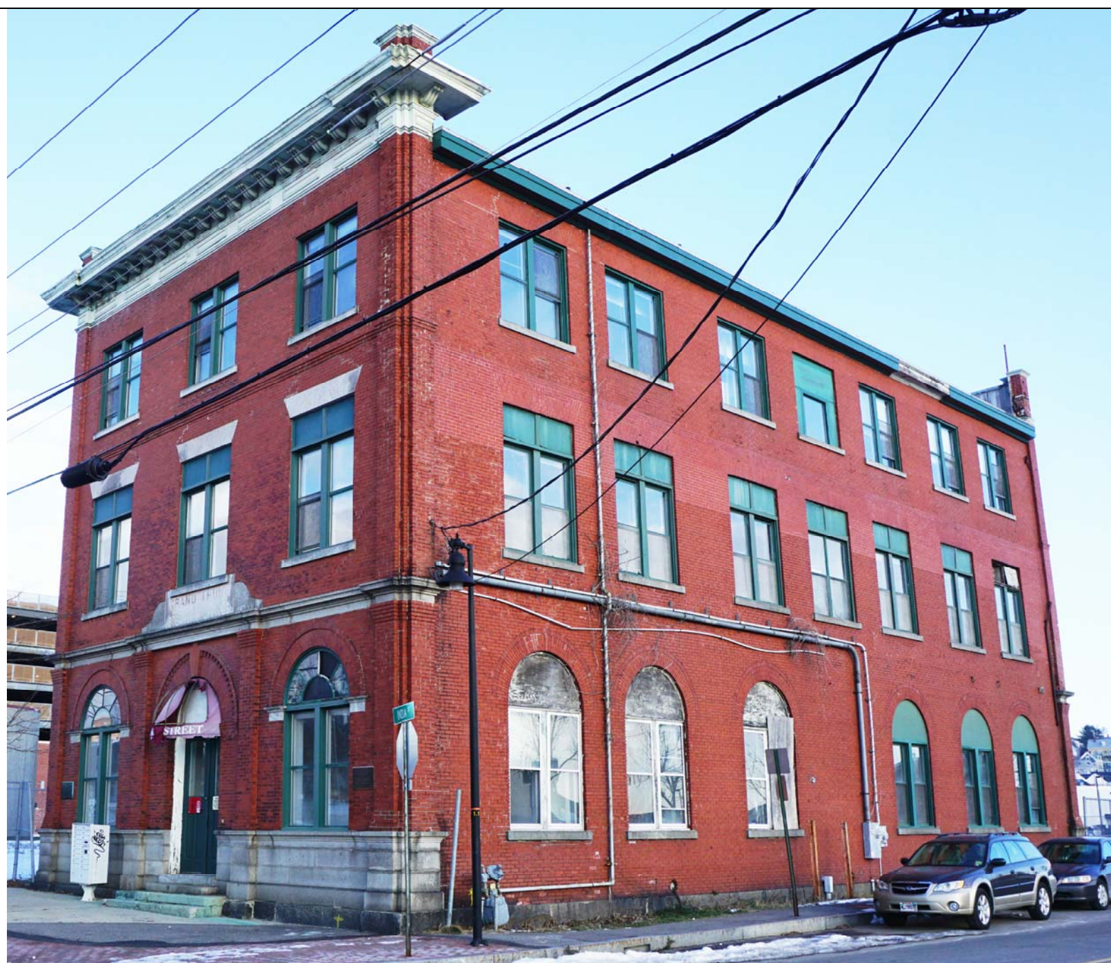
7 SOUTH WEST IMAGE ELEVATION NTS