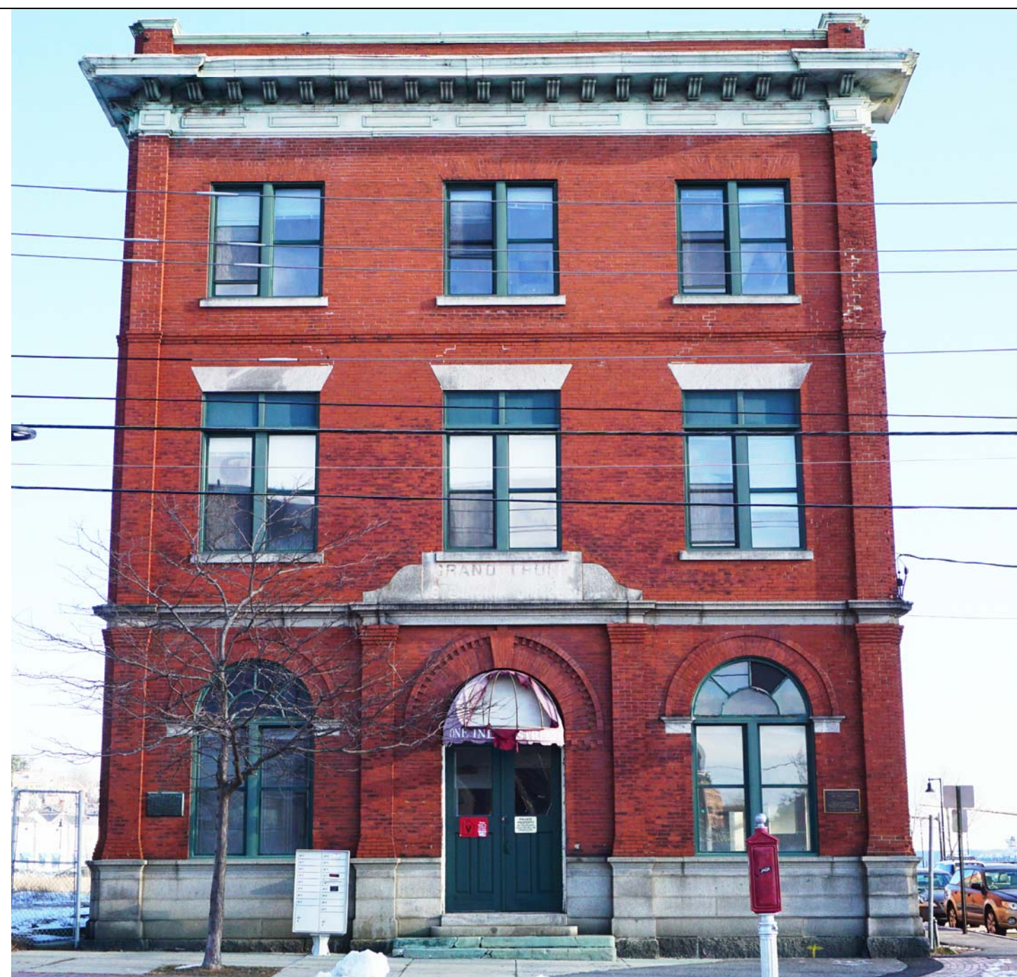
8 WEST IMAGE ELEVATION NTS