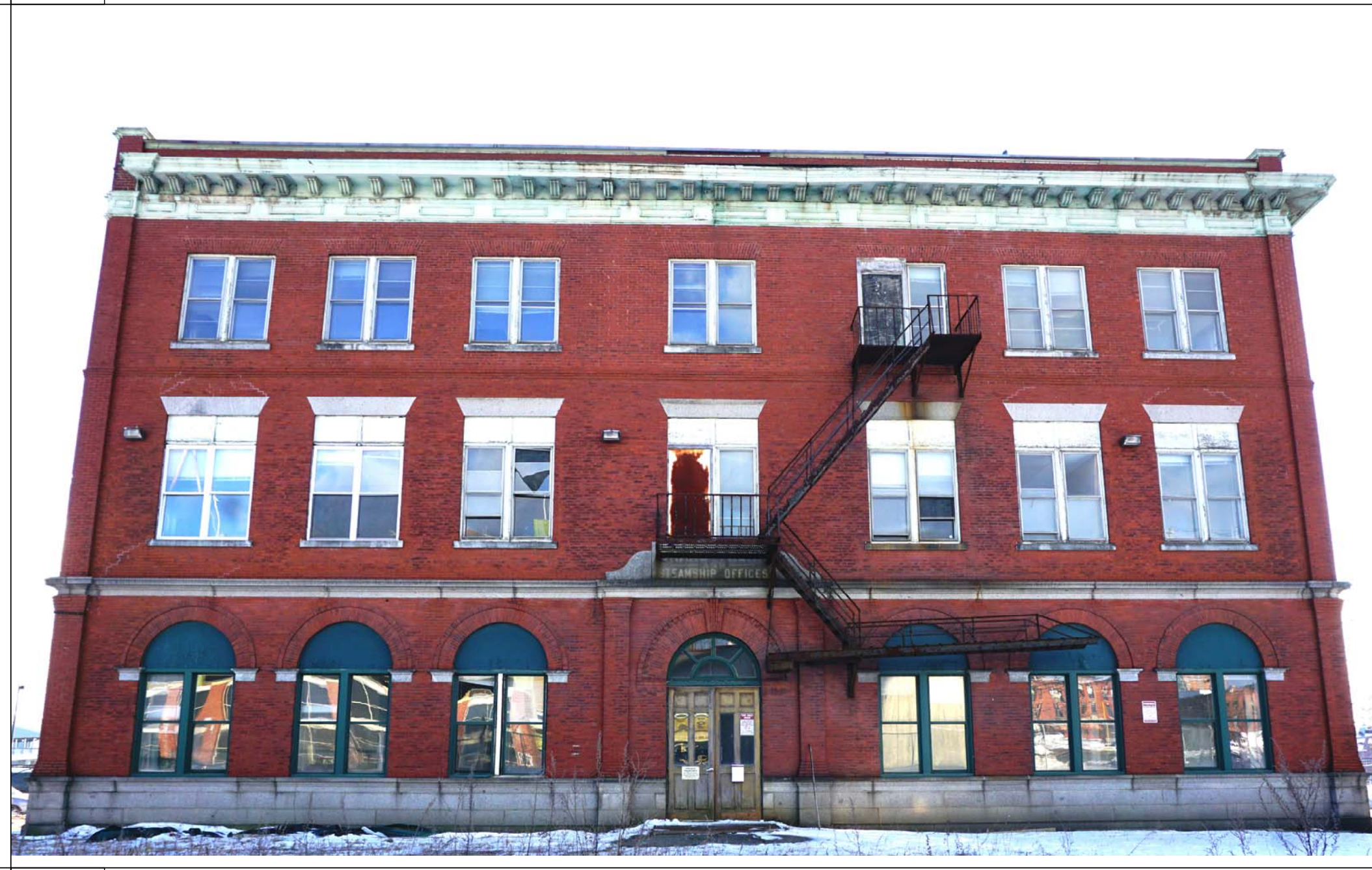
2 NORTH IMAGE ELEVATION NTS