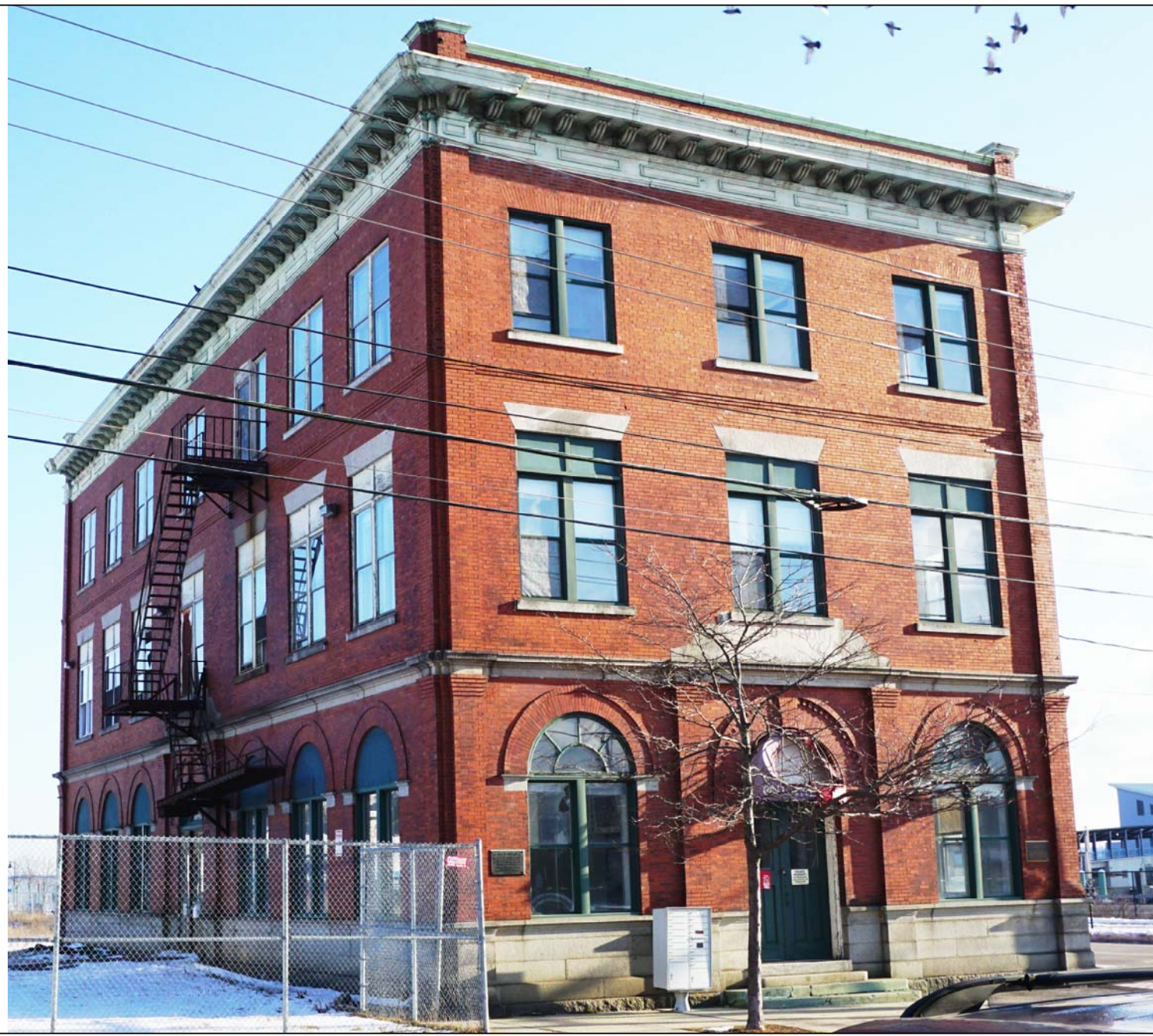
1 NORTH WEST IMAGE ELEVATION NTS