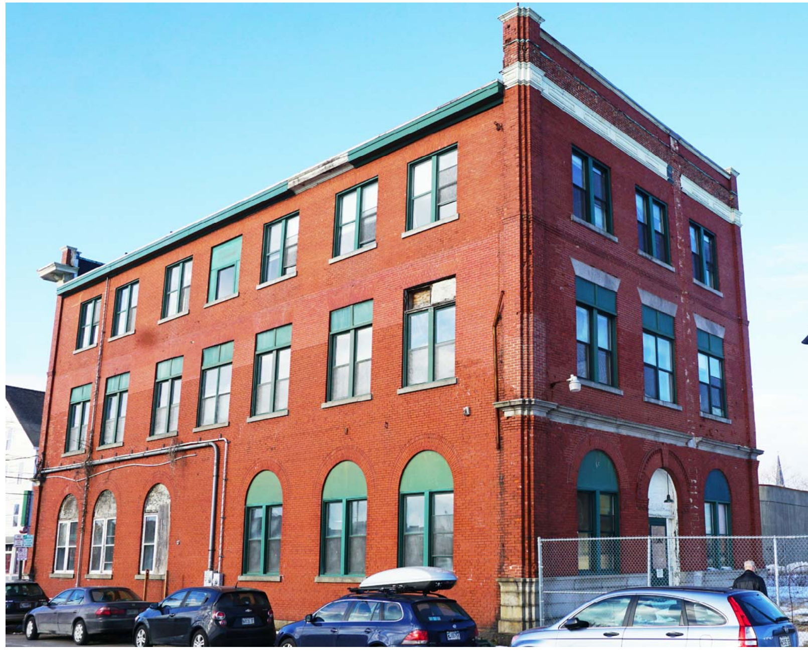
5 SOUTH EAST IMAGE ELEVATION NTS