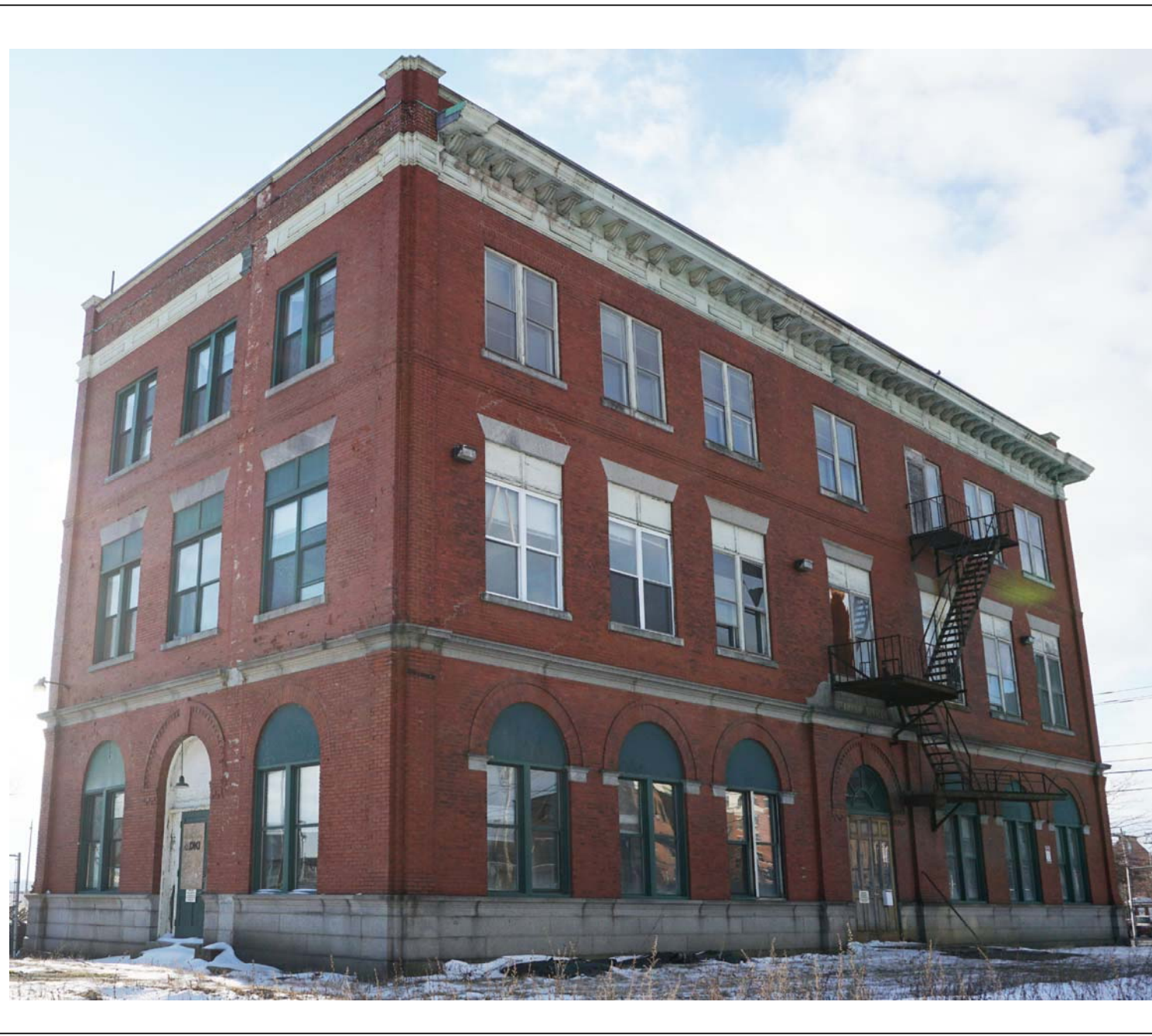
3 NORTH EAST IMAGE ELEVATION NTS