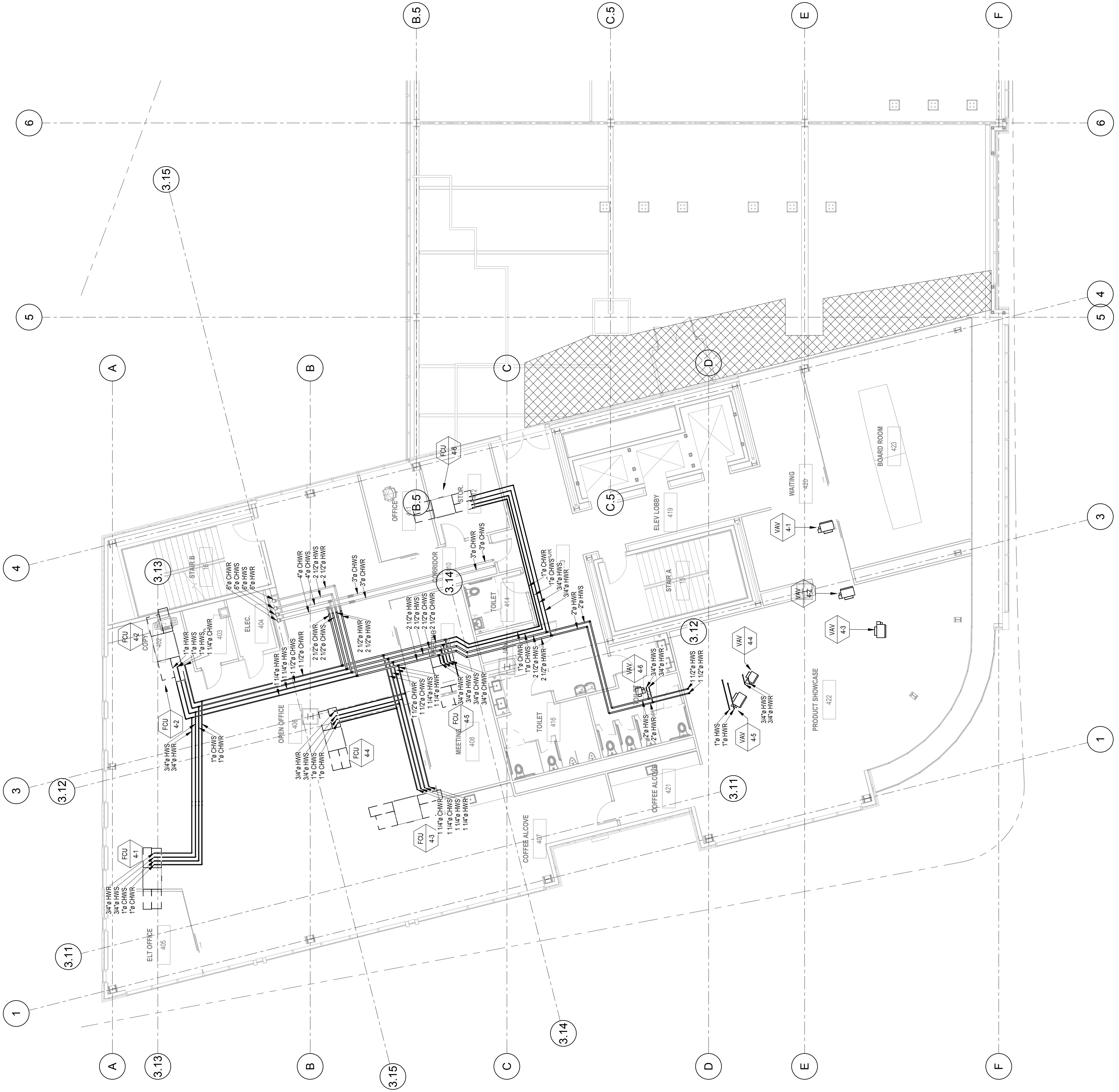
① 4TH FLOOR HVAC PIPING PLAN A 1/8" = 1'-0"