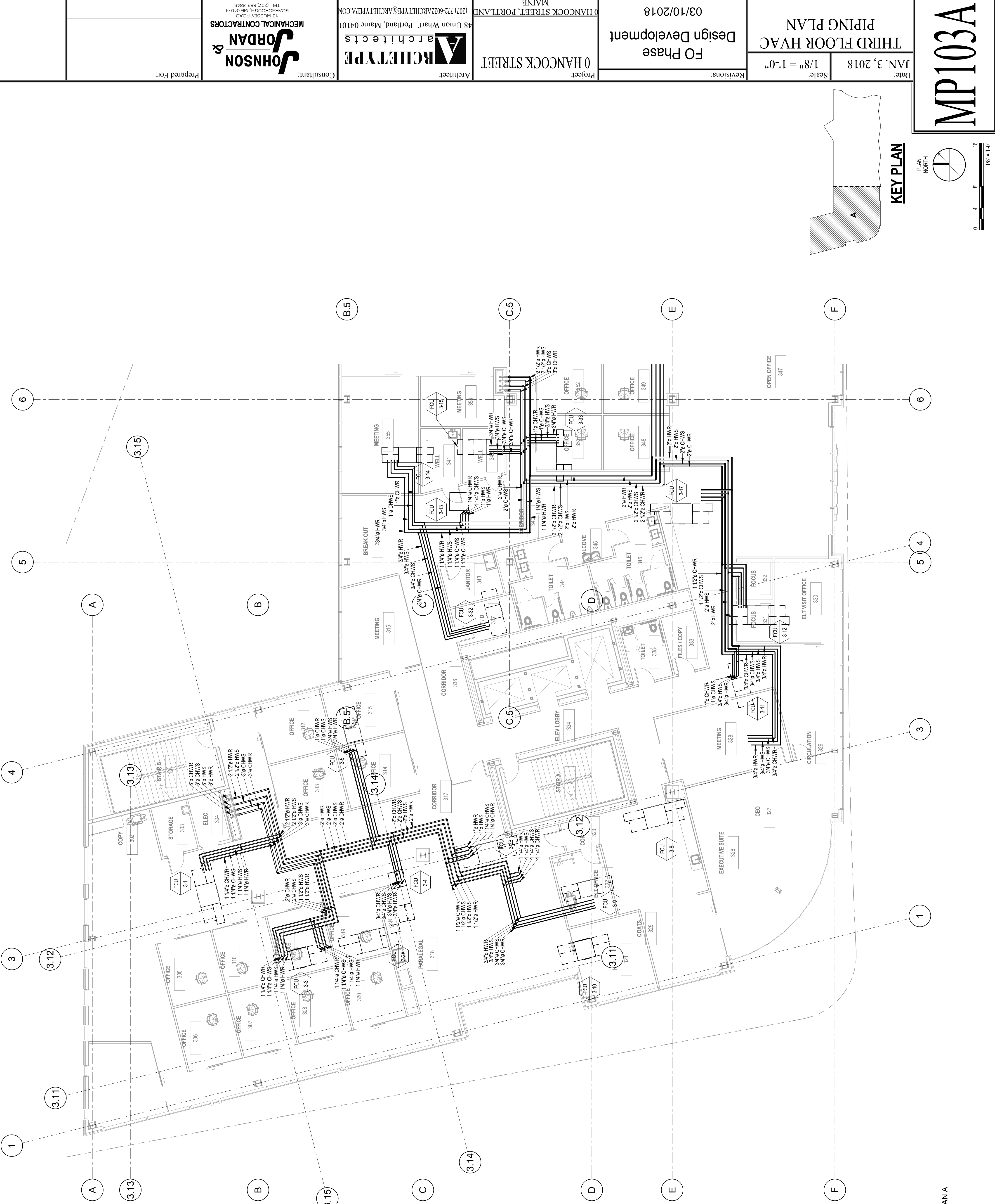
1 3RD FLOOR HVAC PIPING PLAN A 1/8" = 1'-0"