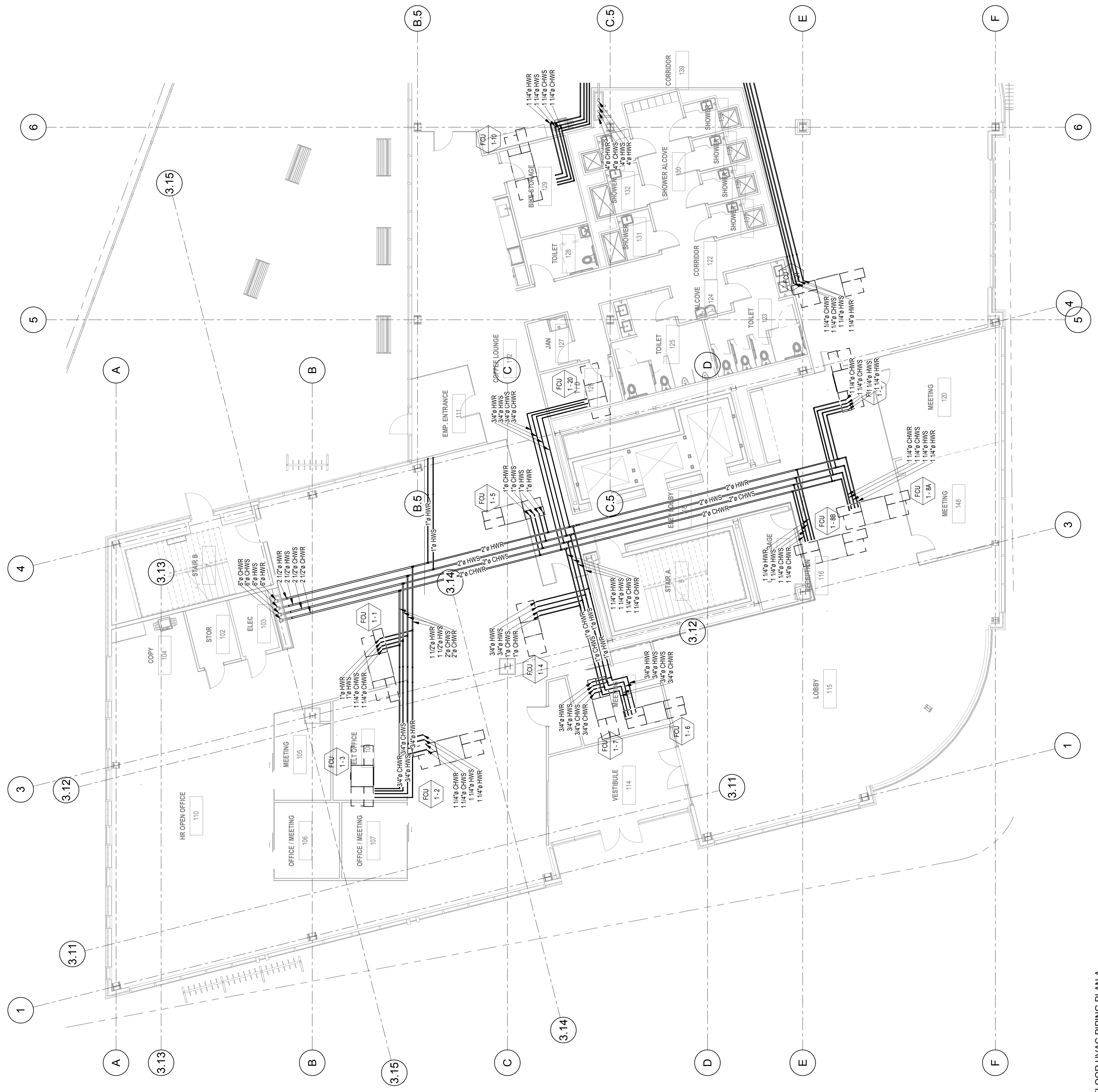
1 1ST FLOOR HVAC PIPING PLAN A 1/8" = 1'-0"