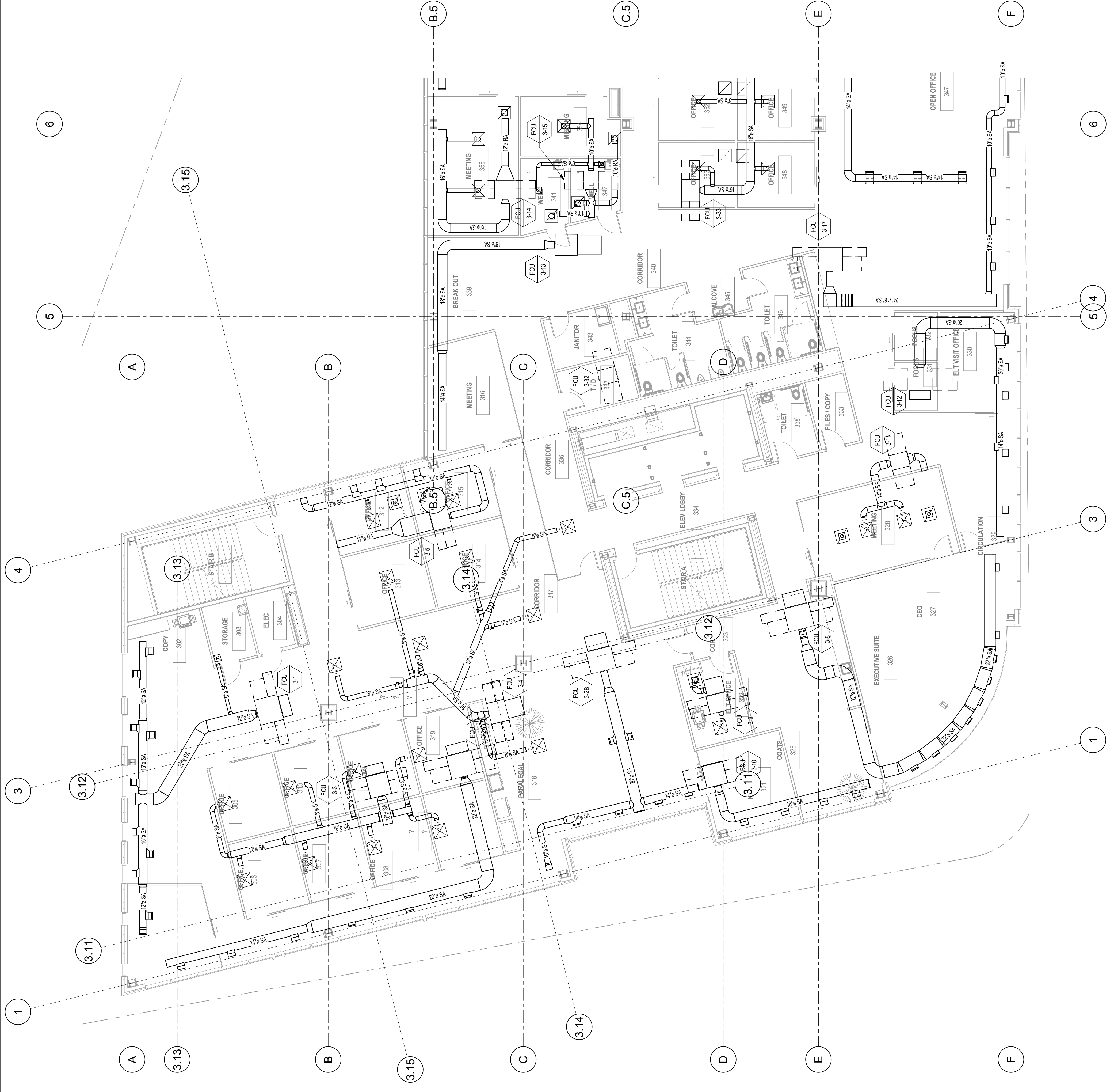
1 3RD FLOOR HVAC DUCTWORK PLAN A 1/8" = 1'-0"