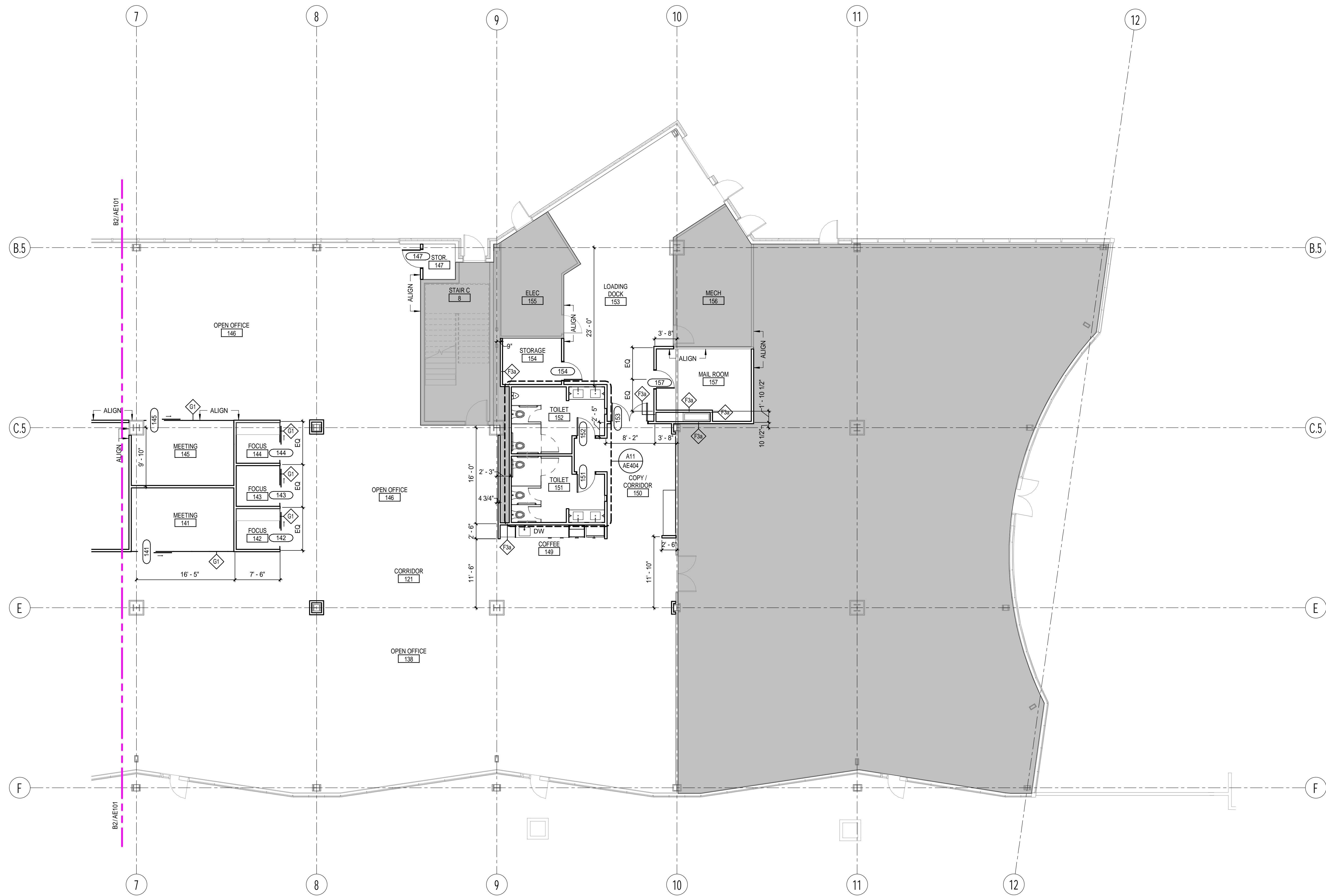
AREA B - LEVEL ONE FLOOR PLAN (B2) 1/8" = 1'-0"