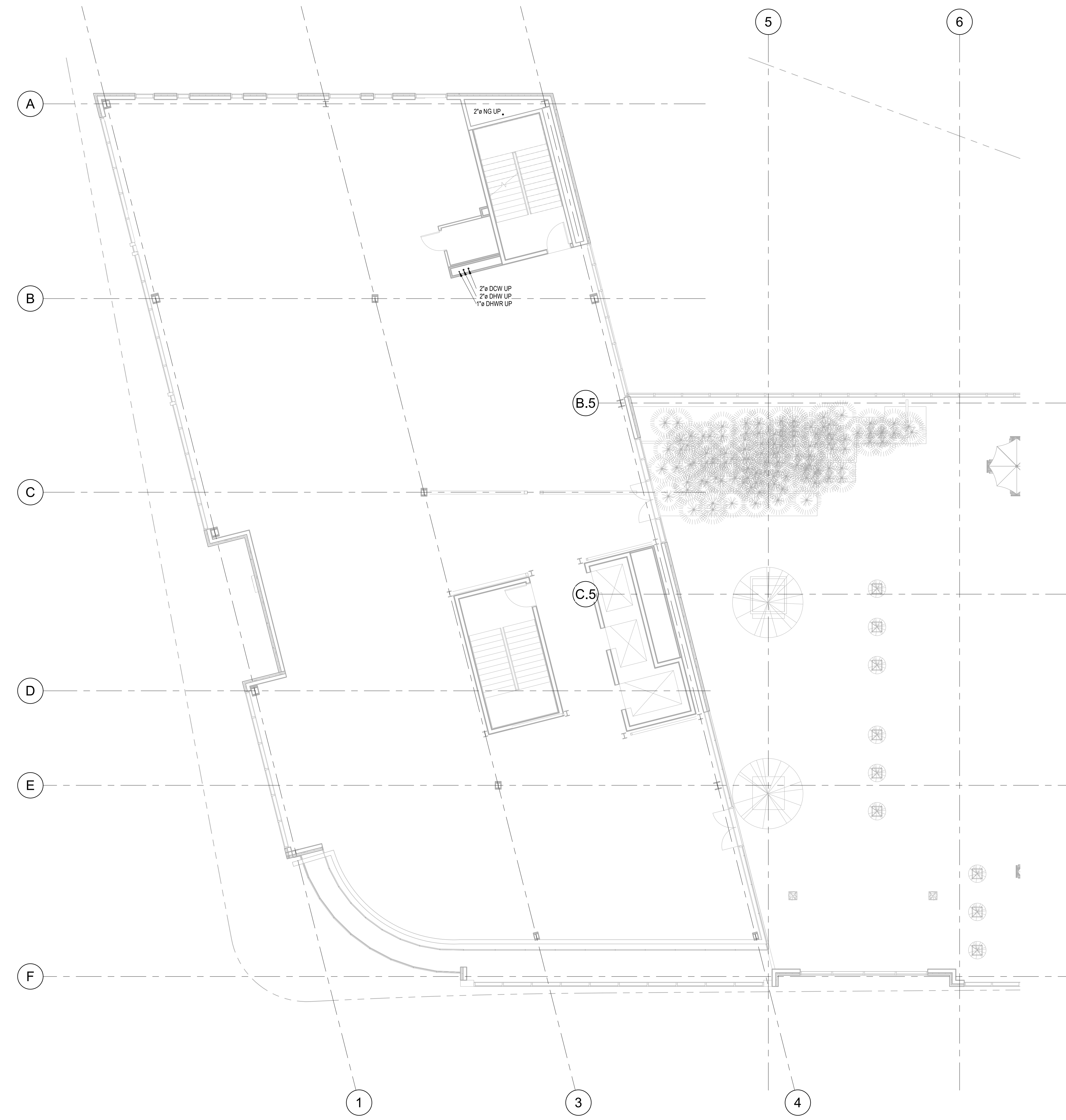
① 4TH FLOOR PPE A 1/8" = 1'-0"