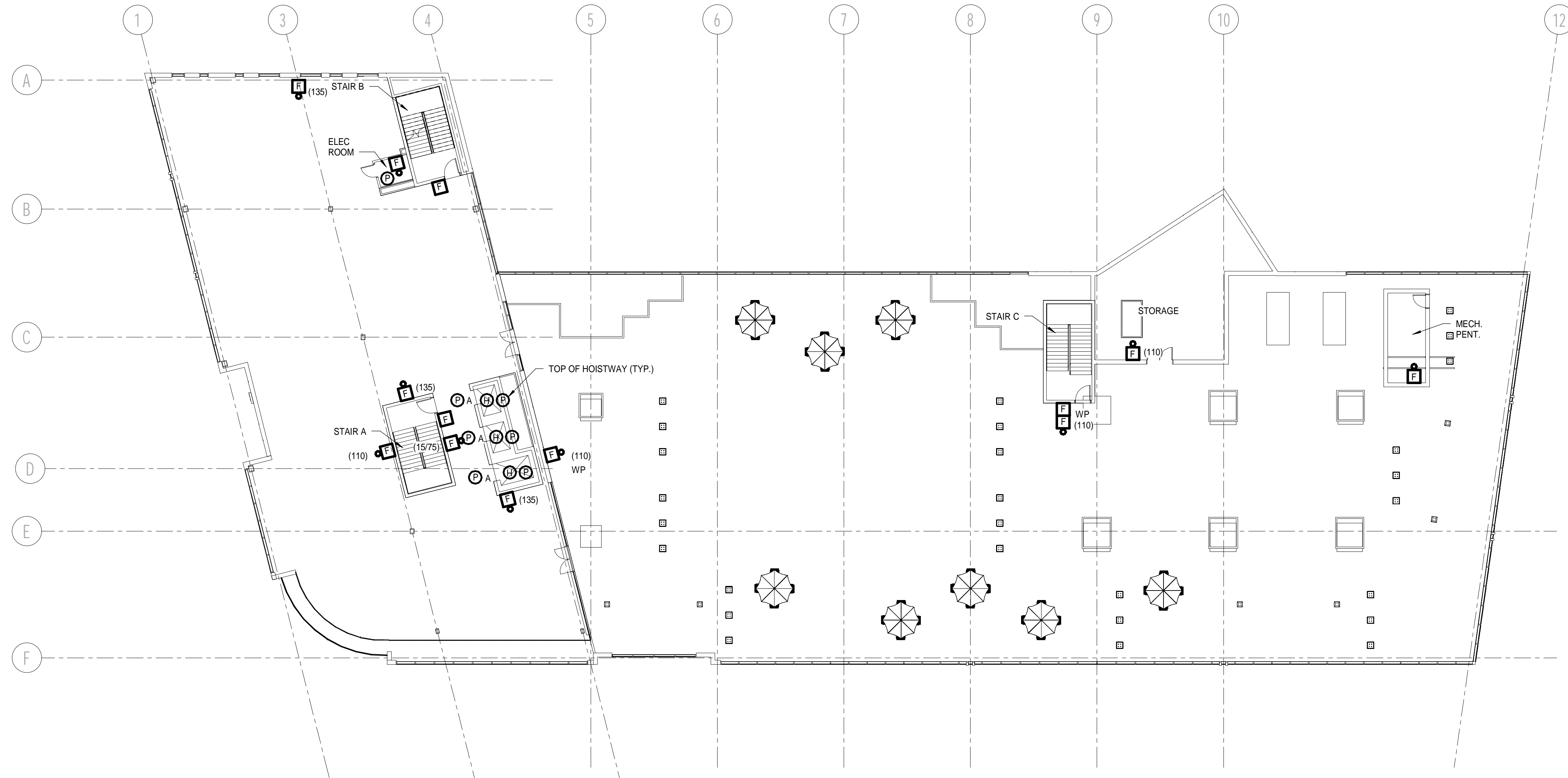
4TH FLOOR SYSTEMS PLAN A1 1/16" = 1'-0"

NOTES: 1. SEE SHEET E-001 FOR LEGEND AND GENERAL NOTES.