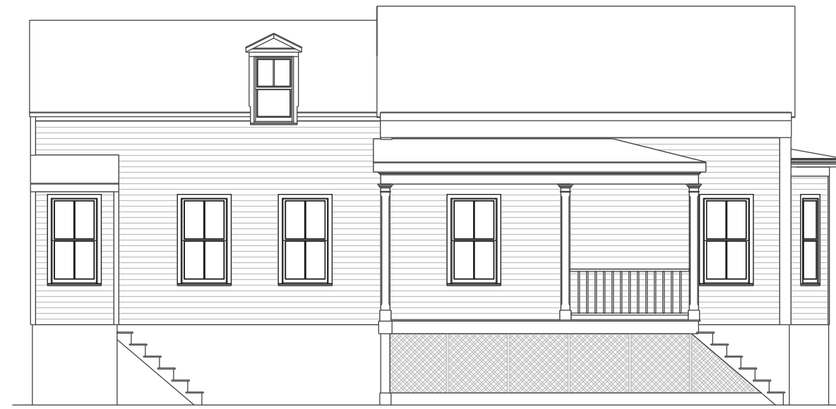
EXISTING LEFT ELEVATION