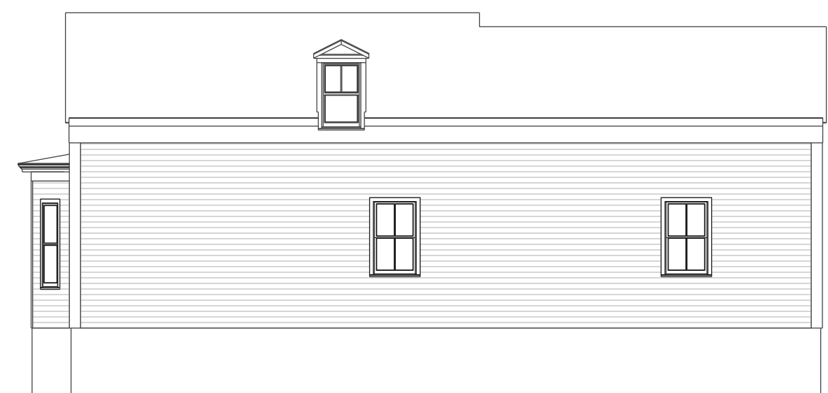
EXISTING RIGHT ELEVATION