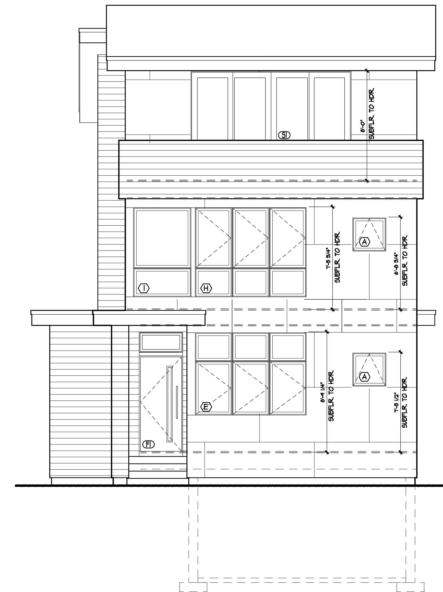
2 WEST ELEVATION A2.1 1/4" = 1'-0"