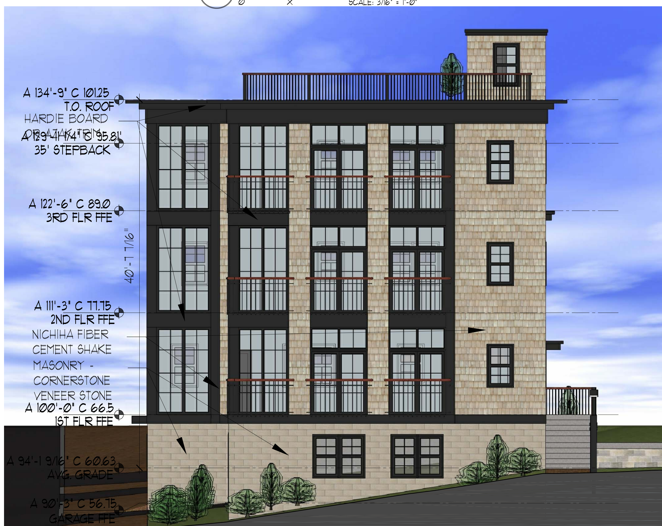
3 ELEVATION - FRONT - FORE ST