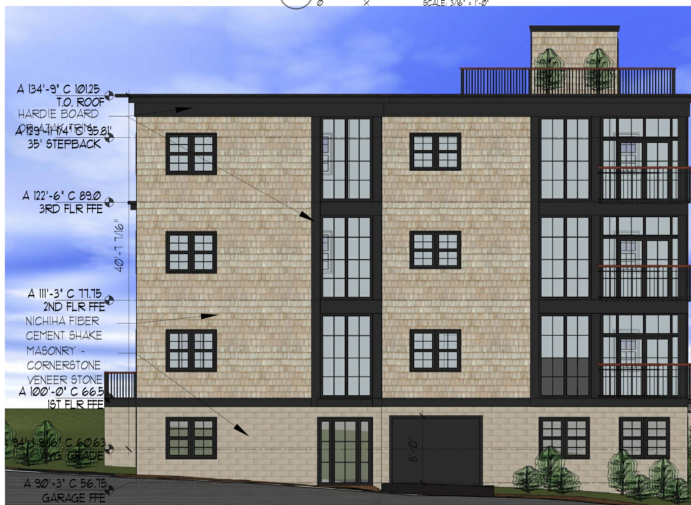
1 ELEVATION - SIDE - WATERVILLE ST