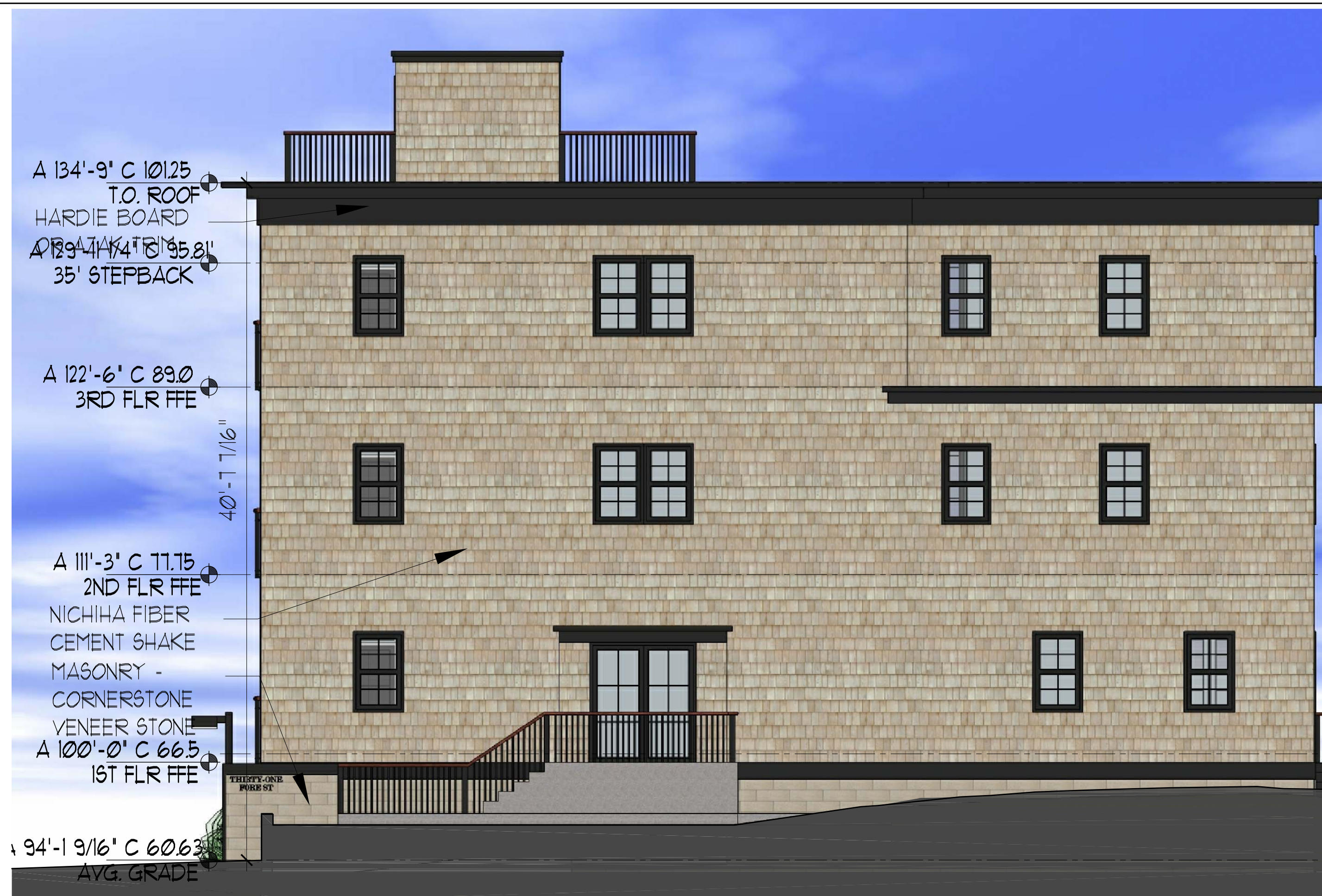
2 ELEVATION - SIDE

NOTE: ELEVATION DATUMS HAVE BOTH ARCHITECTURAL (A) AND CIVIL (C) DIMENSIONS