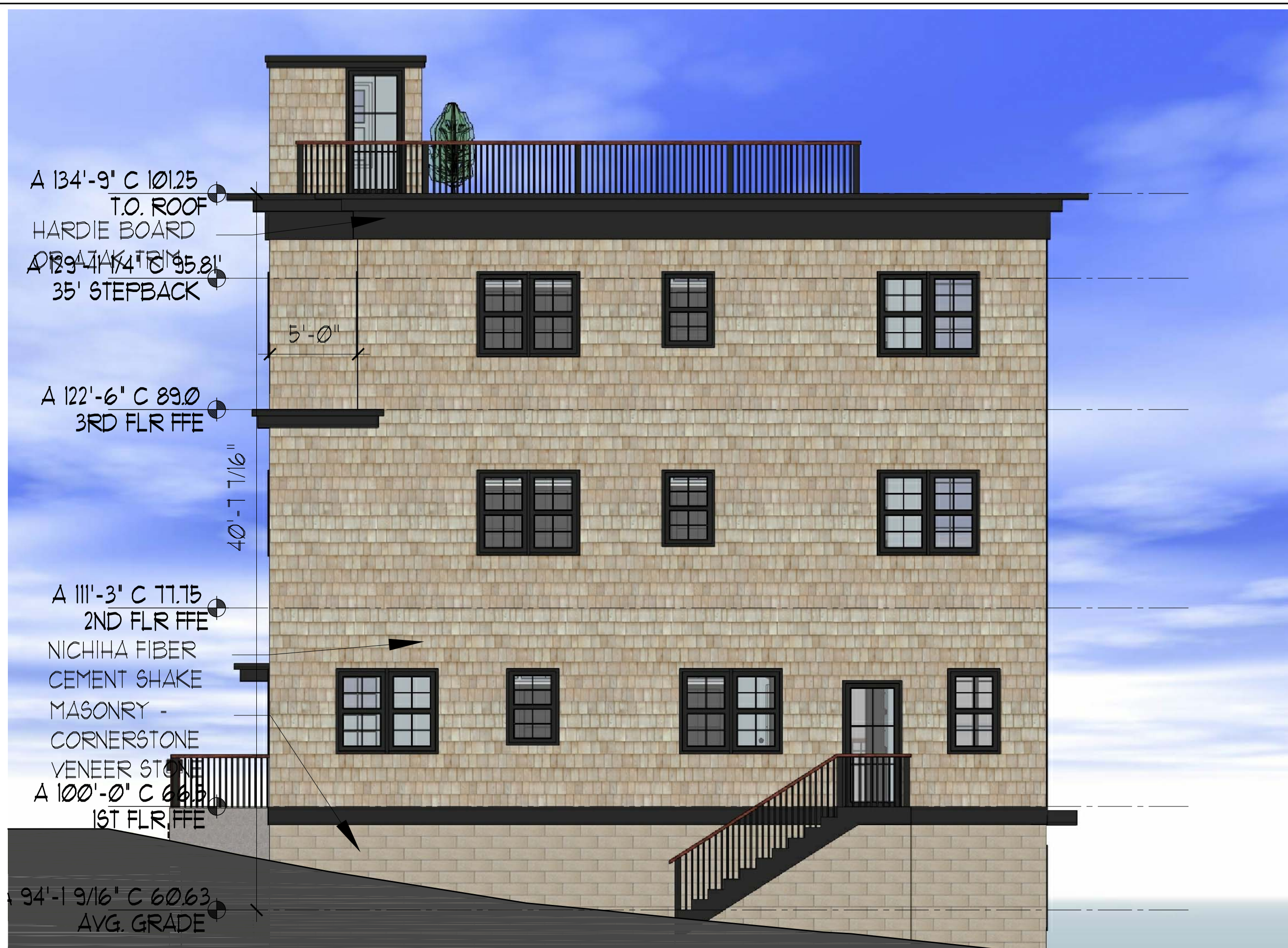
4 ELEVATION - REAR