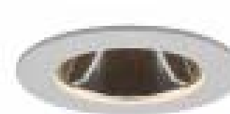
Type D - WILA - 621 3" 60DEG.

This photometric was submitted to show photometrics for the lights at and near the Fore Street entrance as it is so close to abutters. Lighting is also approved for under the canopy of the entrance on Waterville Street as it is understood these are downlights. If proposals change from the ones shown here, the proposed substitutes shall be submitted for review and approval re photometrics and compliance with Technical Standards. J Fraser, Planner 6.17.16