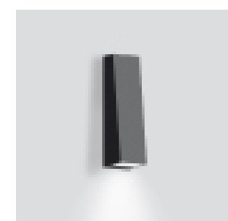
Type F - BEGA US - 33 513