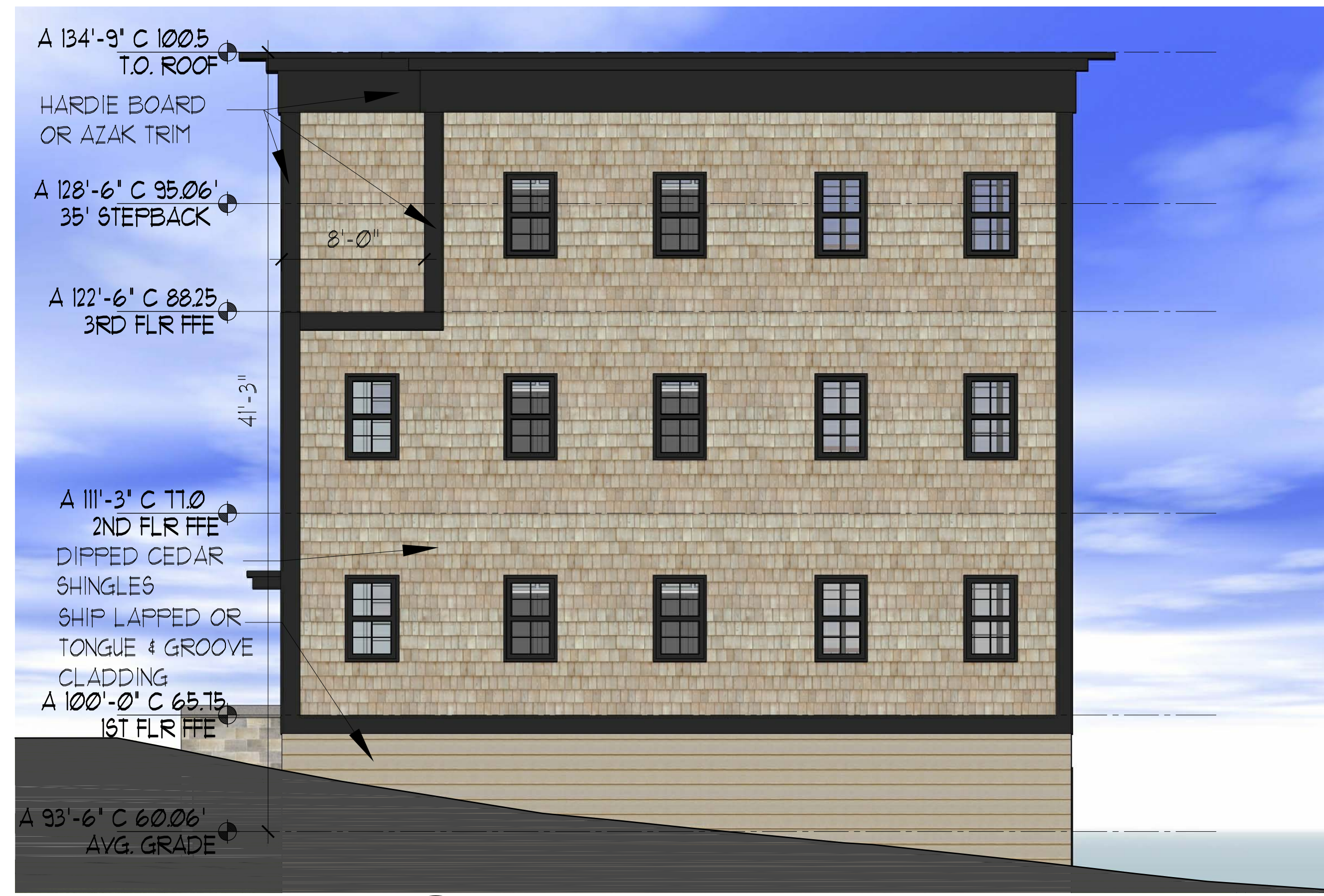
4 ELEVATION - REAR SCALE: 3/16" = 1'-0"