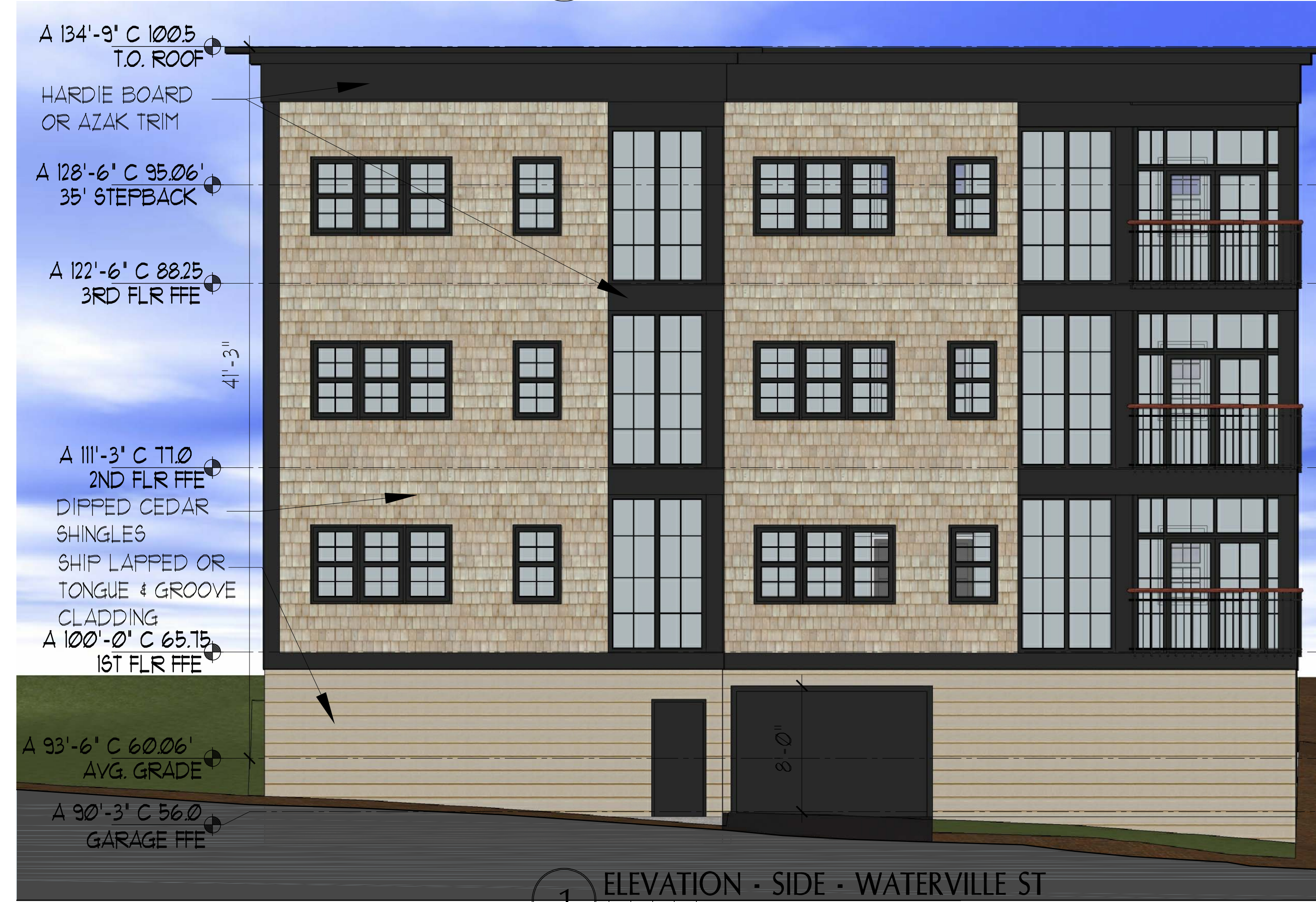
1 ELEVATION - SIDE - WATERVILLE ST SCALE: 3/16" = 1'-0"