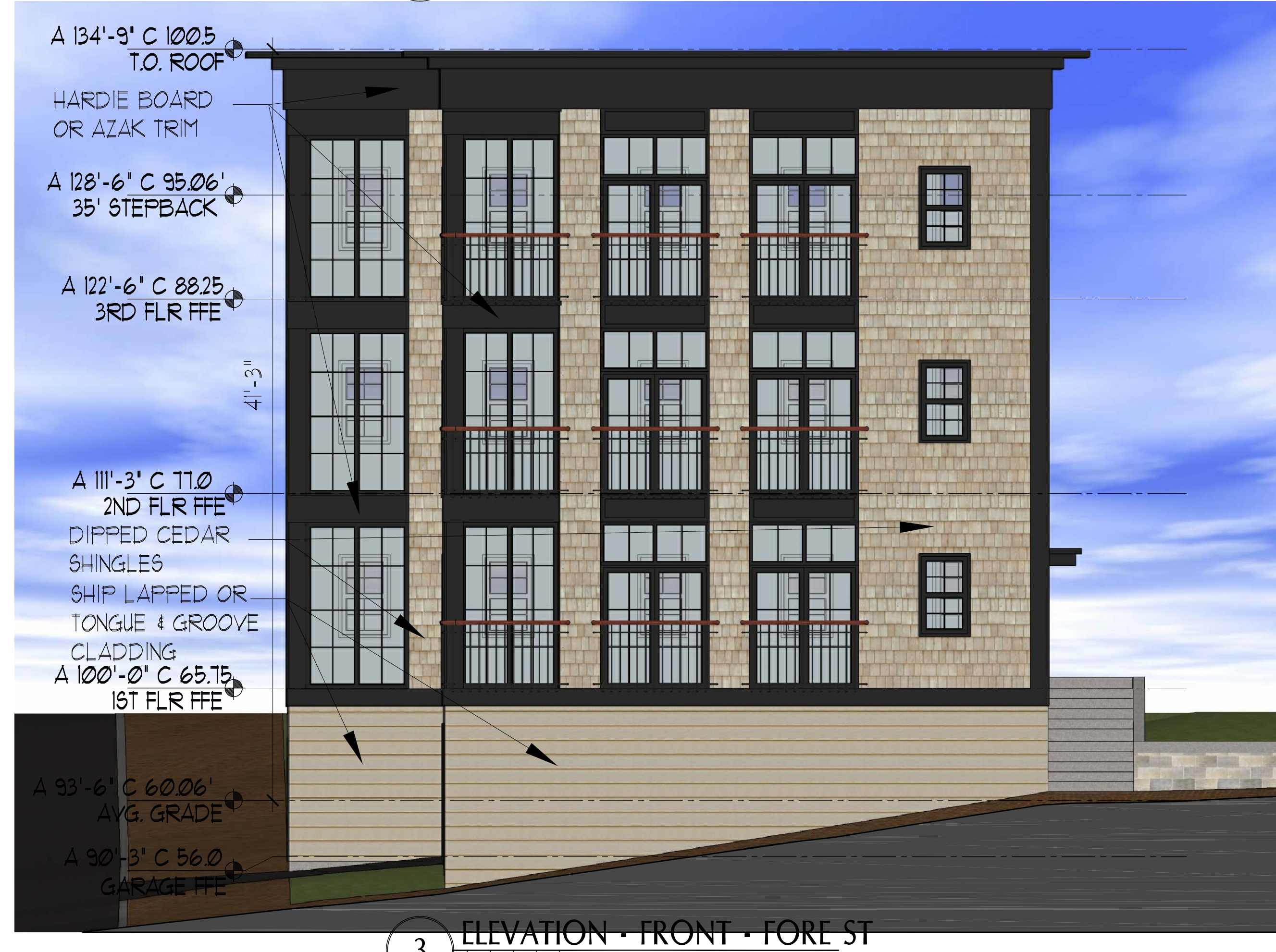
3 ELEVATION - FRONT - FORE ST SCALE: 3/16" = 1'-0"