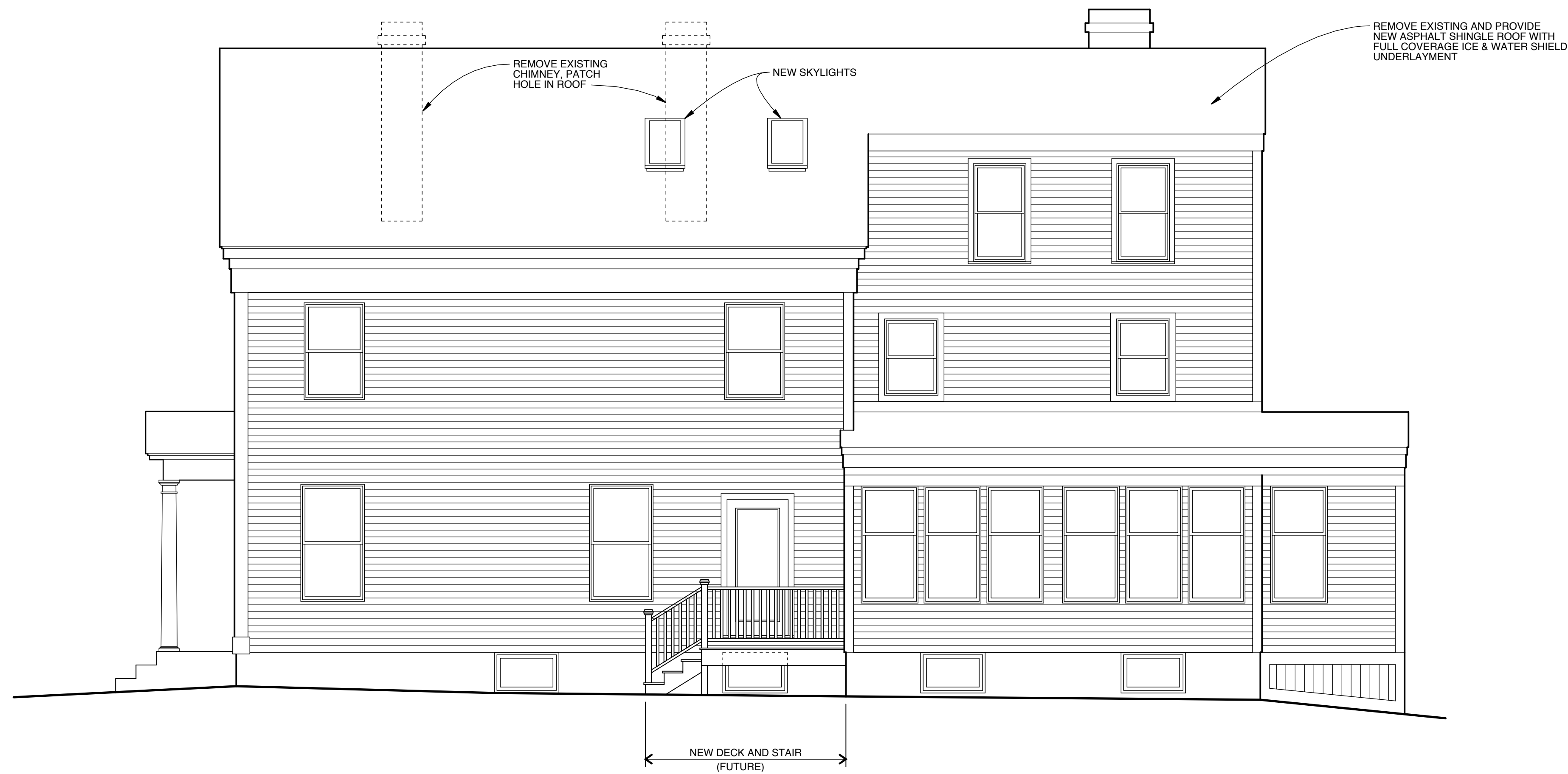
1 SOUTH ELEVATION SCALE: 1/8" = 1'-0"