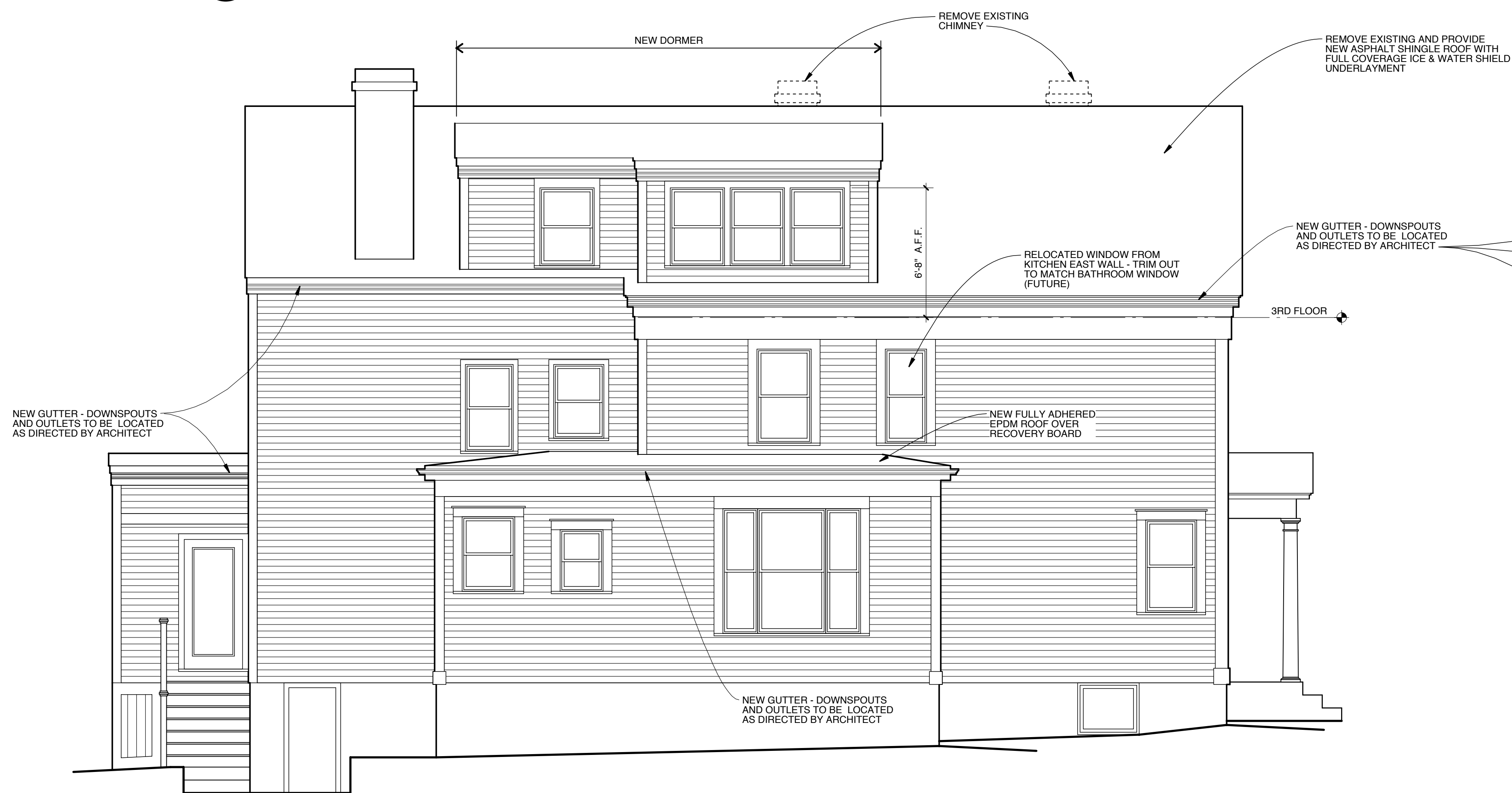
3 NORTH ELEVATION SCALE: 1/8" = 1'-0"