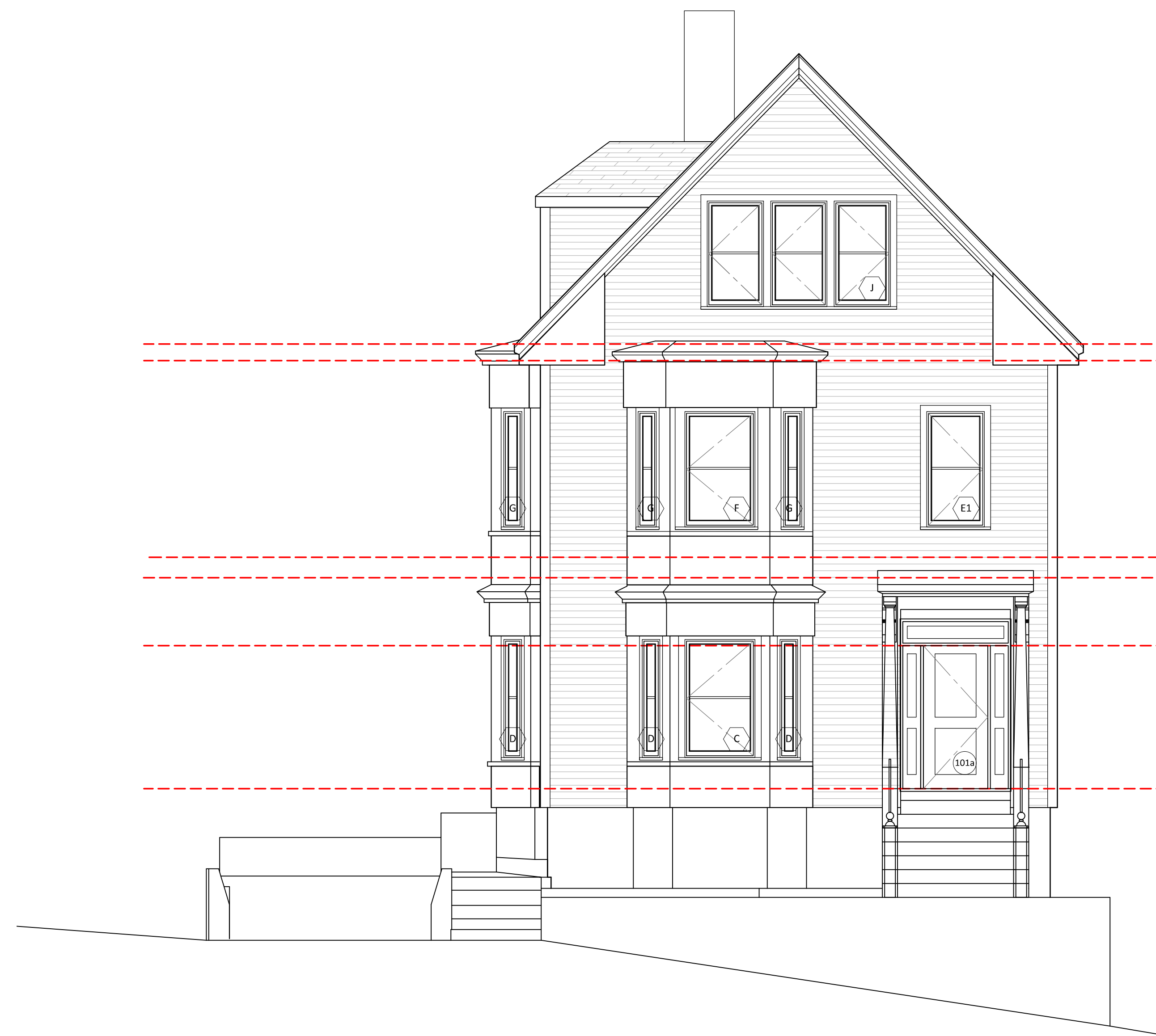
1 SOUTH ELEVATION \frac{1}{4}'' = 1'-0''