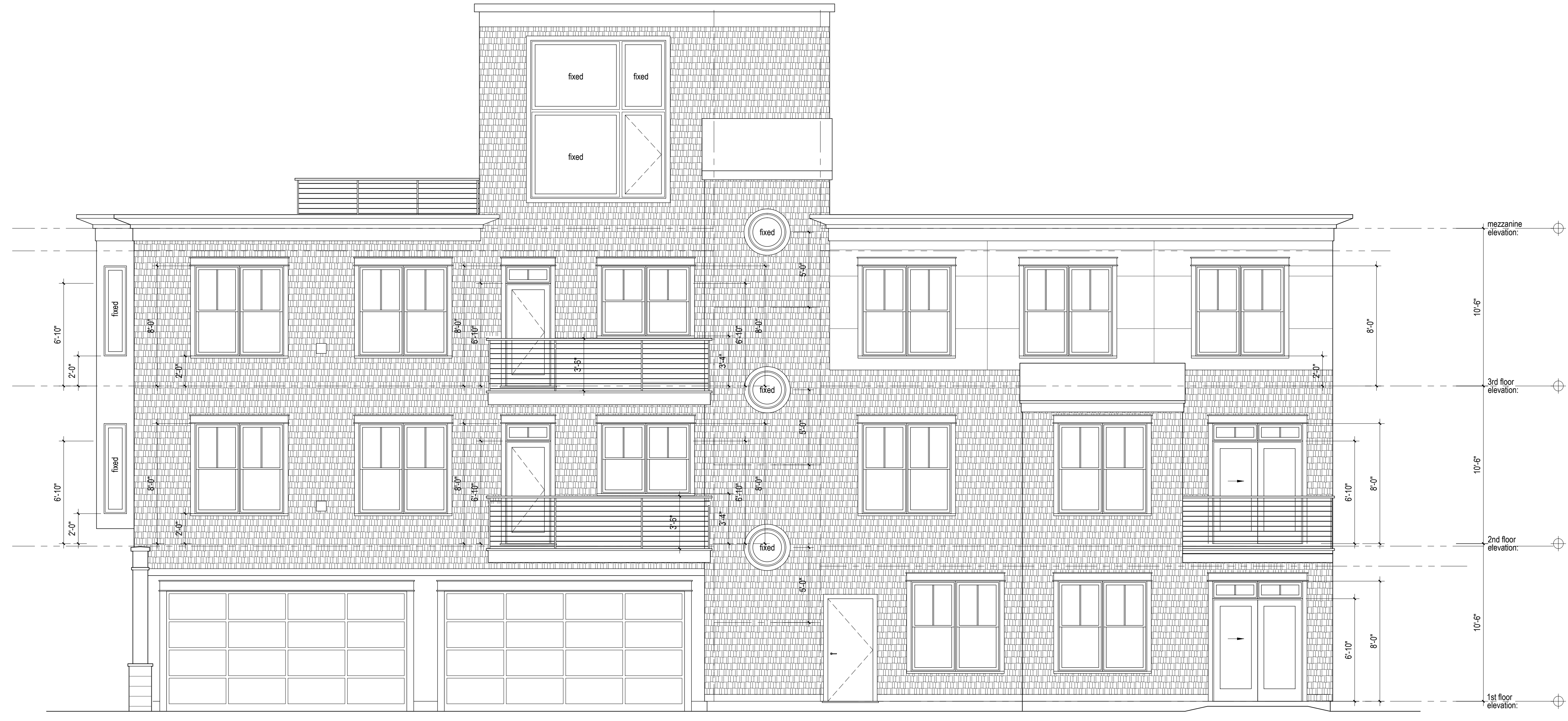
1 Side (South) Elevation 1/4" = 1'-0"