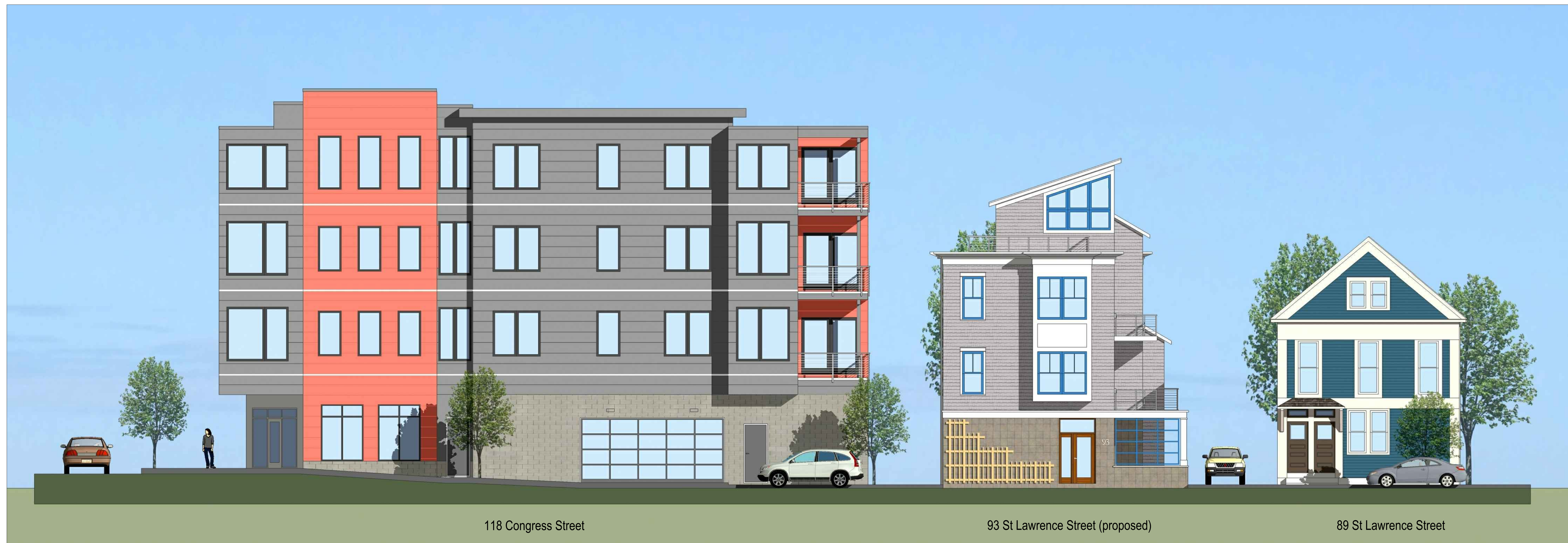
St. Lawrence Street Context Elevations