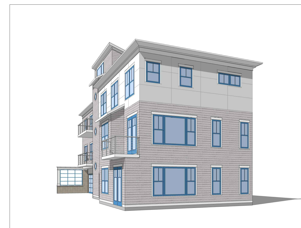
Perspective Views of Proposed Building