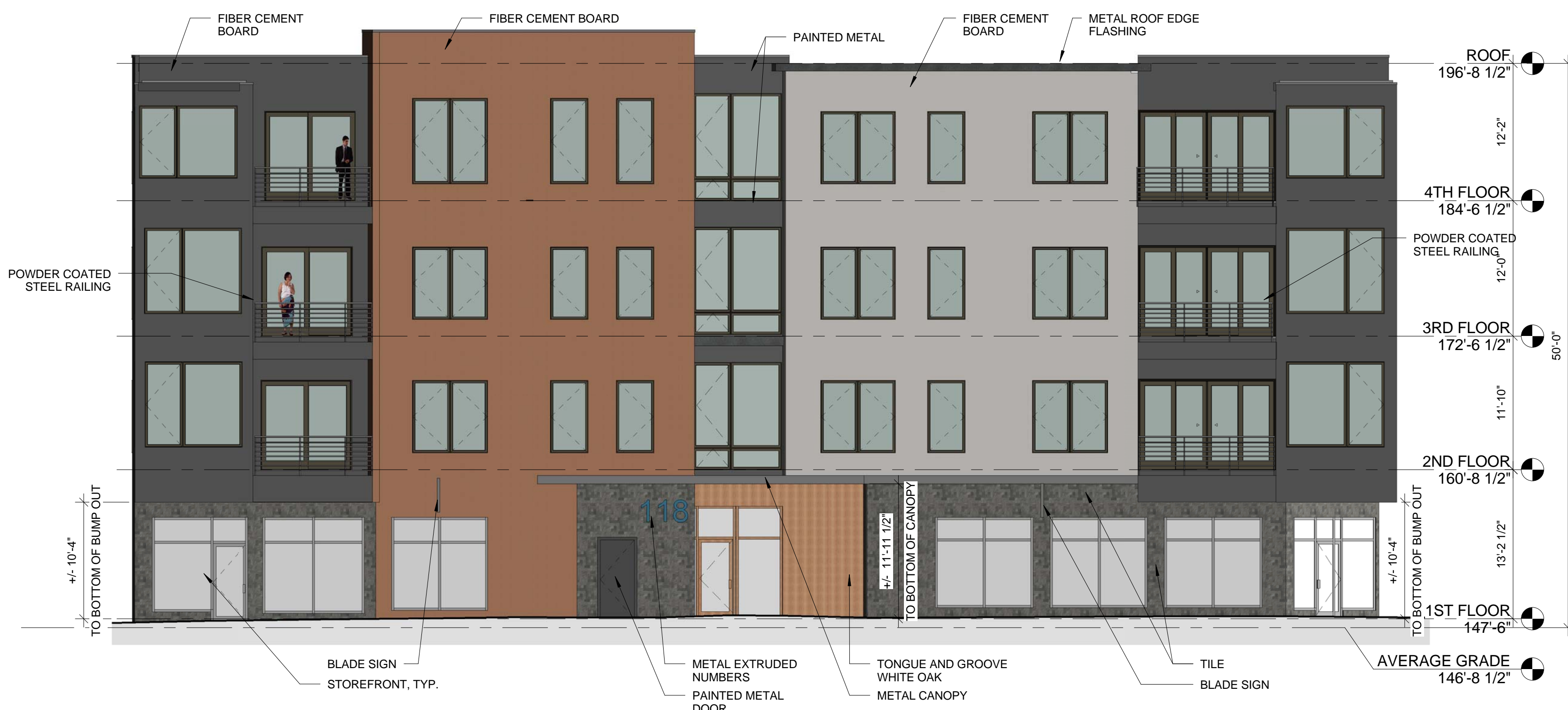
1 NORTH ELEVATION 1/8" = 1'-0"