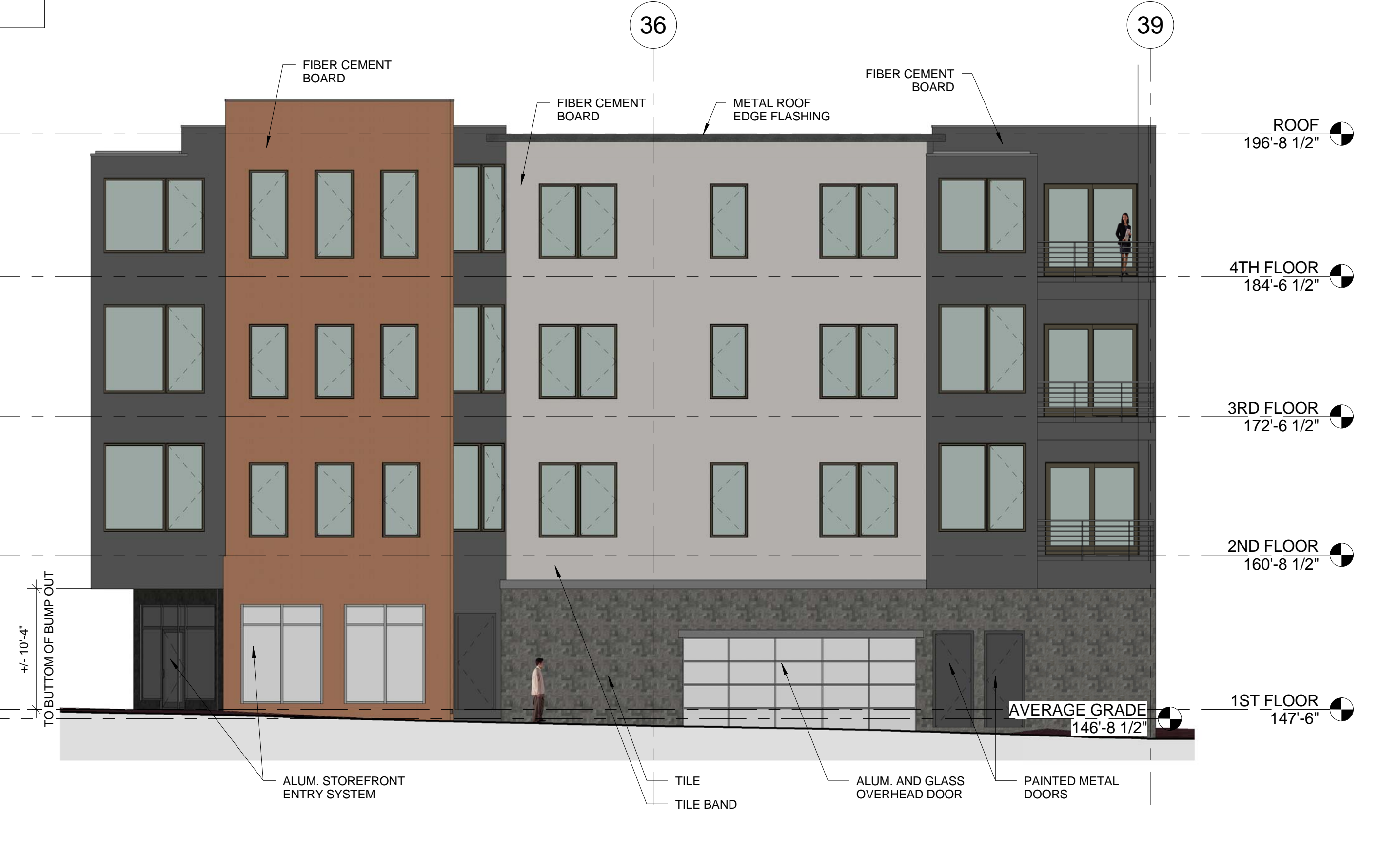
4 WEST ELEVATION 1/8" = 1'-0"

Prepared For: 118 on Munjoy Hill, LLC 118 CONGRESS STREET PORTLAND, ME 04101