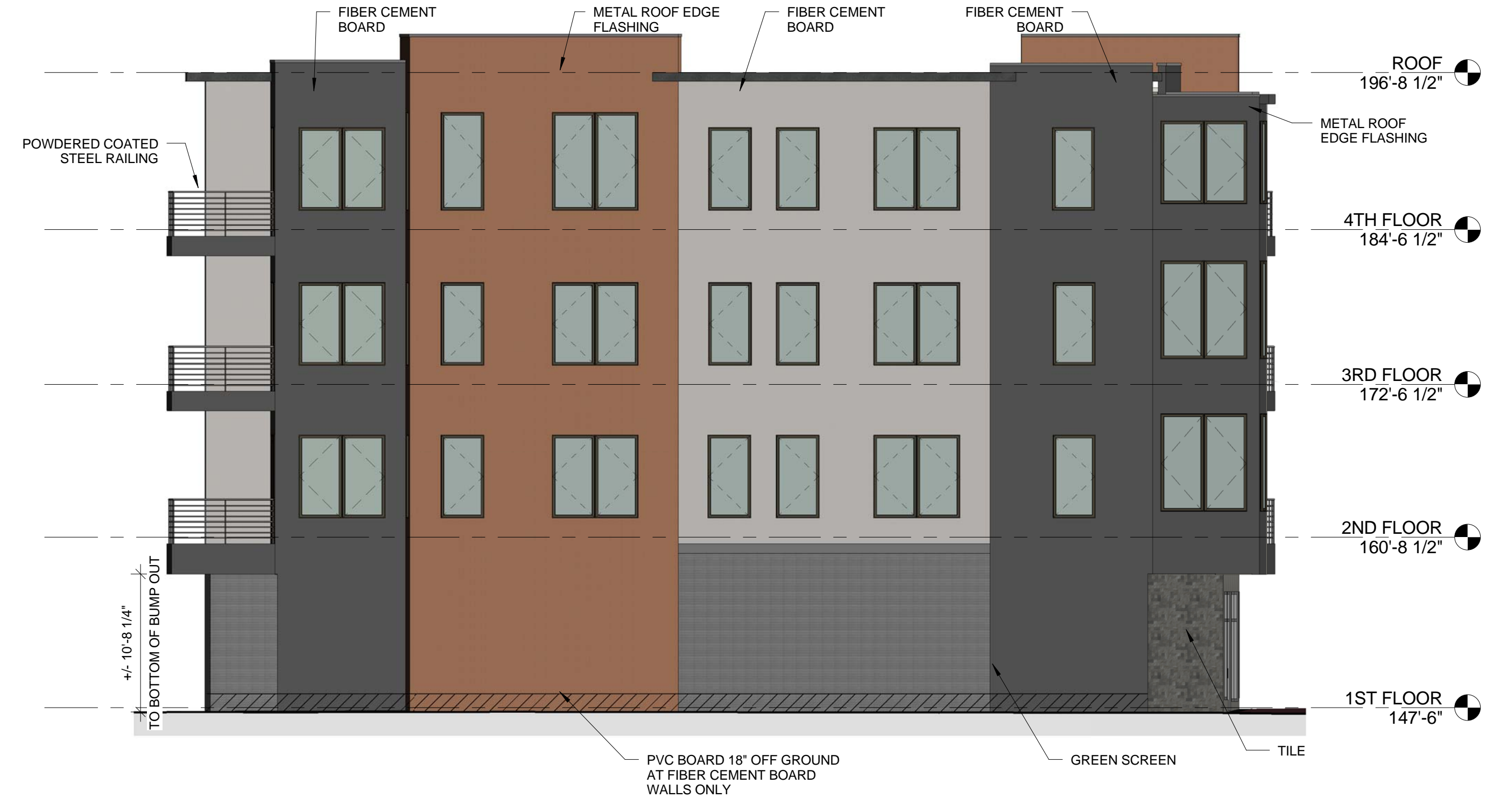
2 EAST ELEVATION 1/8" = 1'-0"

Encroachments 8 feet or more above grade per IBC 2009 Sec. 3202.3 Awnings, canopies, marquees and signs. Awnings, canopies, marquees and signs with less than 15 feet clearance above the sidewalk shall not extend into or occupy more than two-thirds the width of the sidewalk measured from the building. Our Congress Street sidewalk is 13'-3/4" (156.75") wide, two-thirds of the width of the sidewalk is 8'-8 1/2" (104.5"). Our canopy extends out 2'-4" and the two blade signs extend out 3'-0". Windows, balconies, architectural features and mechanical equipment. Where the vertical clearance to such is more than 8' the following applies: 1 inch of encroachment is permitted for each additional 1 inch of clearance above 8 feet. The maximum encroachment shall be 4 feet. On Congress Street the vertical clearance is 10'-4", which is 2'-4" above 8 feet. Our permitted encroachment is 2'-4". Our balconies/ building bumps out are 2'-4". On St. Lawrence Street the vertical clearance is 12'-8", which is 4'-8" above 8 feet. Our permitted encroachment is 4'-0" (max. allowed). Our balcony/ building bump out is 2'-6".