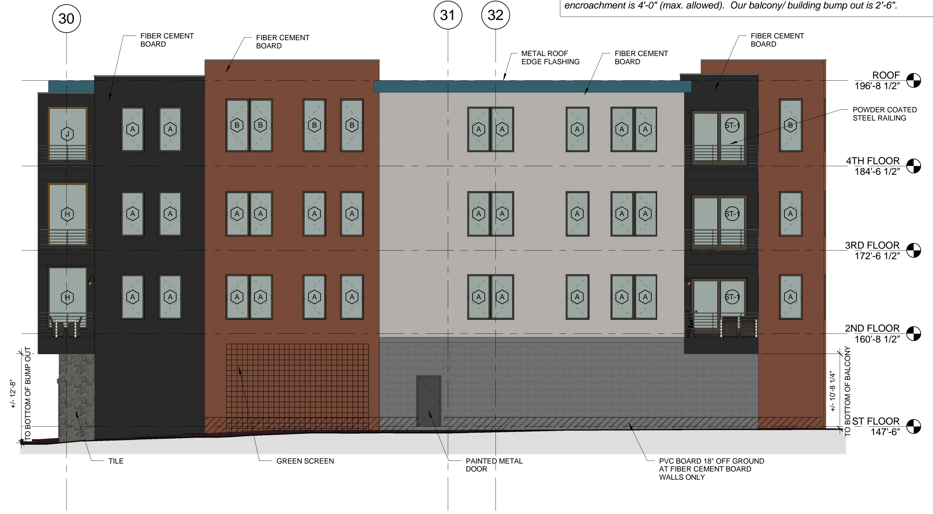
3 | SOUTH ELEVATION 1/8" = 1'-0"

GENERAL NOTES: BUILDING HEIGHT BY DEFINITION: 4 CORNER AVERAGE GRADE - 147.15' + 147.25' + 145.00' + 147.45' / 4 = 146.71' AVERAGE 146' - 8 1/2" + 50' = 196' - 8 1/2" ALLOWABLE BUILDING HEIGHT (HEIGHT MEASURED TO TOP OF STEEL) ROOF PENTHOUSES NOT SHOWN IN 2D ELEVATIONS