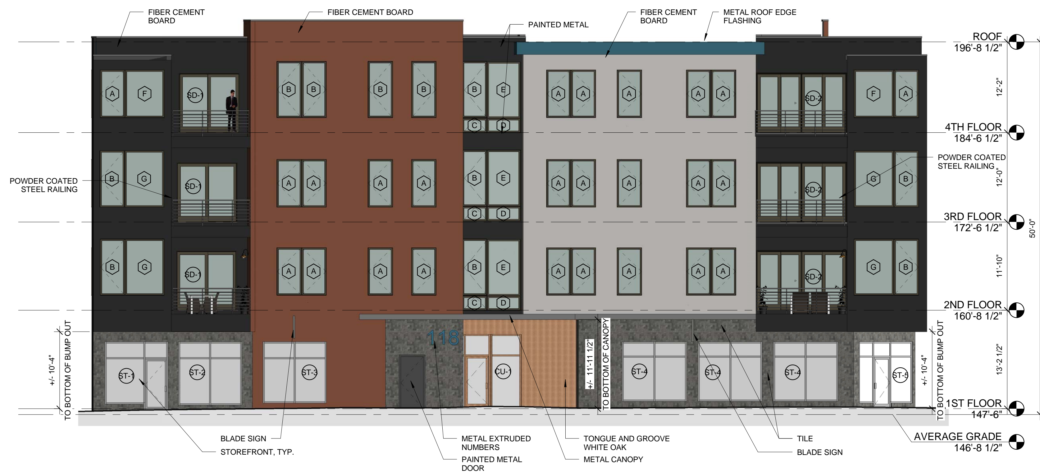
1 | NORTH ELEVATION 1/8" = 1'-0"