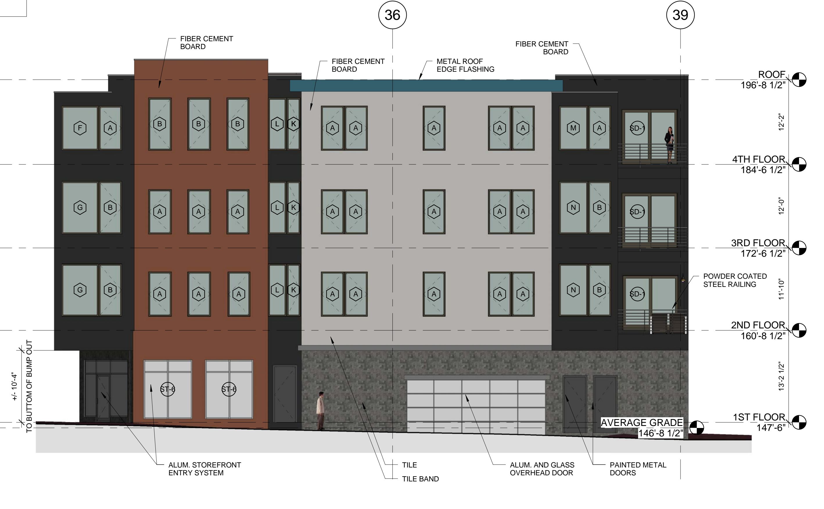
4 | WEST ELEVATION 1/8" = 1'-0"