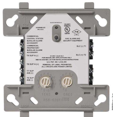
NMM-100(A) (Type H)

Use to monitor a zone of four-wire smoke detectors, manual fire alarm pull stations, waterflow devices, or other normally-open dry-contact alarm activation devices. May also be used to monitor normally-open supervisory devices with special supervisory indication at the control panel. Monitored circuit may be wired as an NFPA Style B (Class B) or Style D (Class A) Initiating Device Circuit. A 47K ohm End-of-Line Resistor (provided) terminates the Style B circuit. No resistor is required for supervision of the Style D circuit.