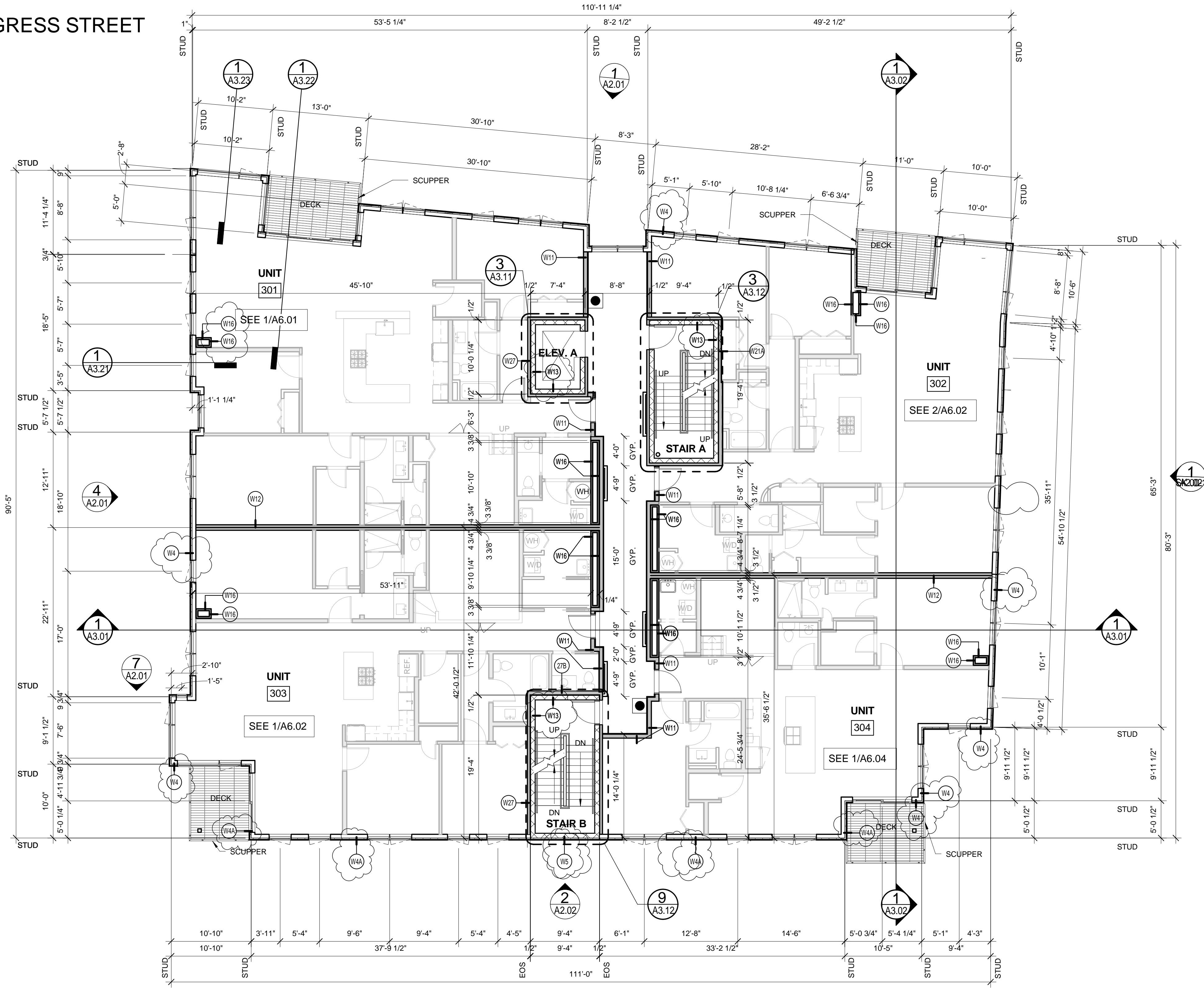
1 | 3RD FLOOR PLAN 1/8" = 1'-0" 0 2' 4' 8'