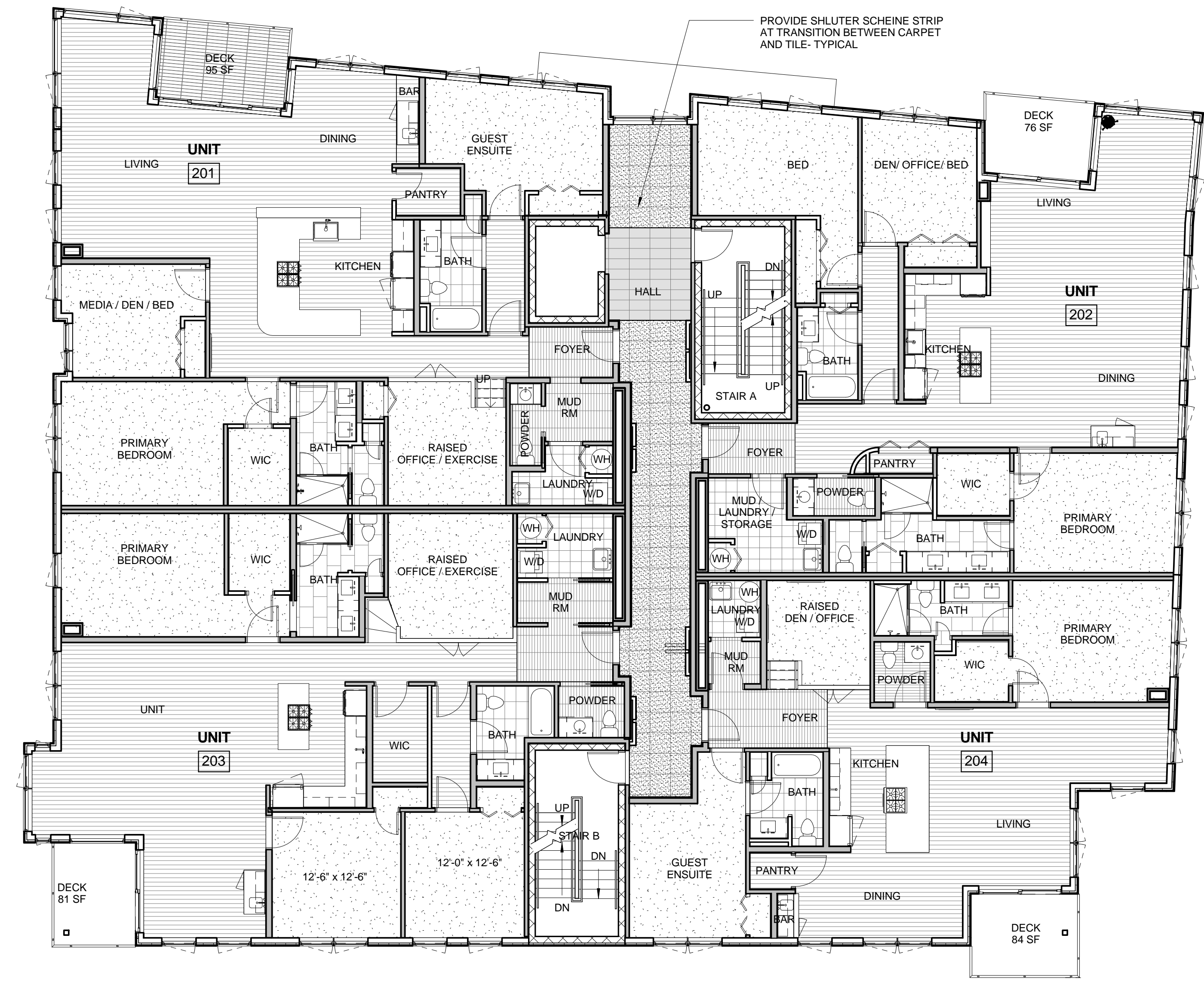
1 | TYP. UPPER FLOOR PLAN