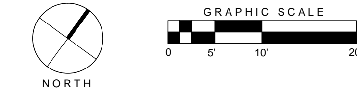
1 LANDSCAPE PLAN SCALE: 1" = 10'-0"