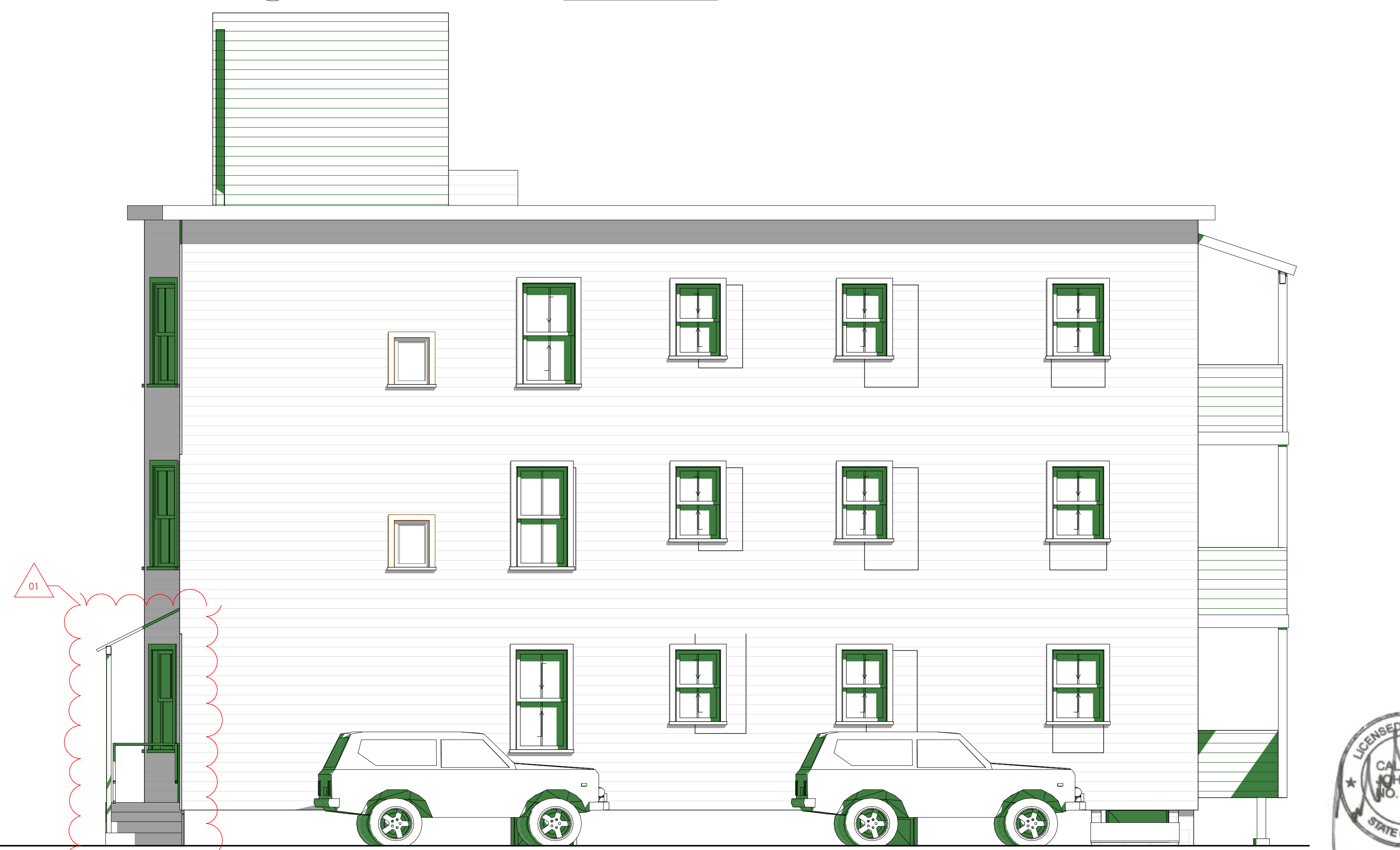
1 WEST ELEVATION SCALE: 1/4" = 1'-0"