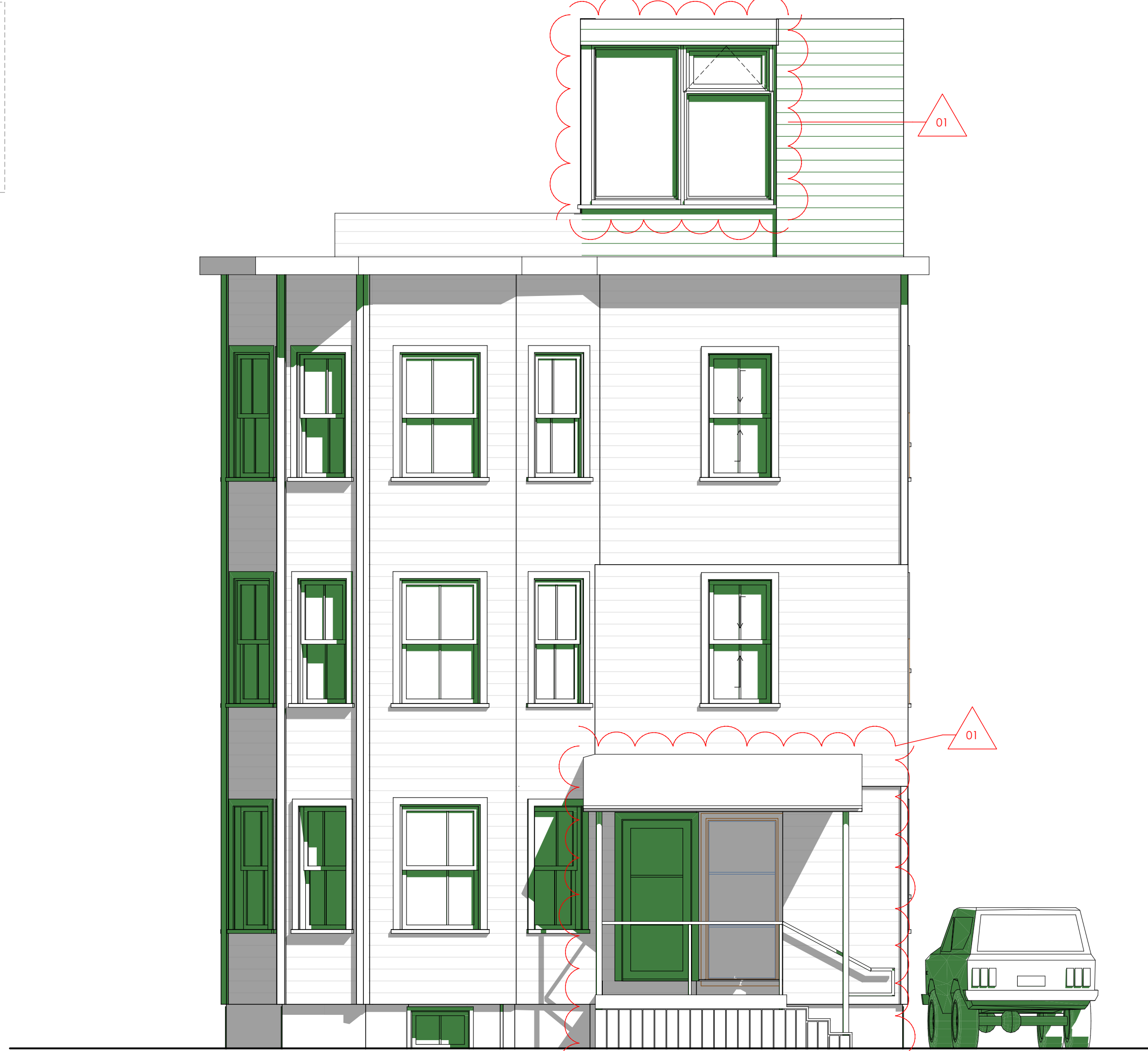
2 NORTH ELEVATION SCALE: 1/4" = 1'-0"

/Volumes/Network Files/CJAB/PROJECTS/B COMMERCIAL-STUDIO/1 Current Projects/Grisanti Munjoy St/1 DESIGN/DRAWINGS/5 CD/ARCHCAD/Grasanti CD 8.21.17 AC19.pln