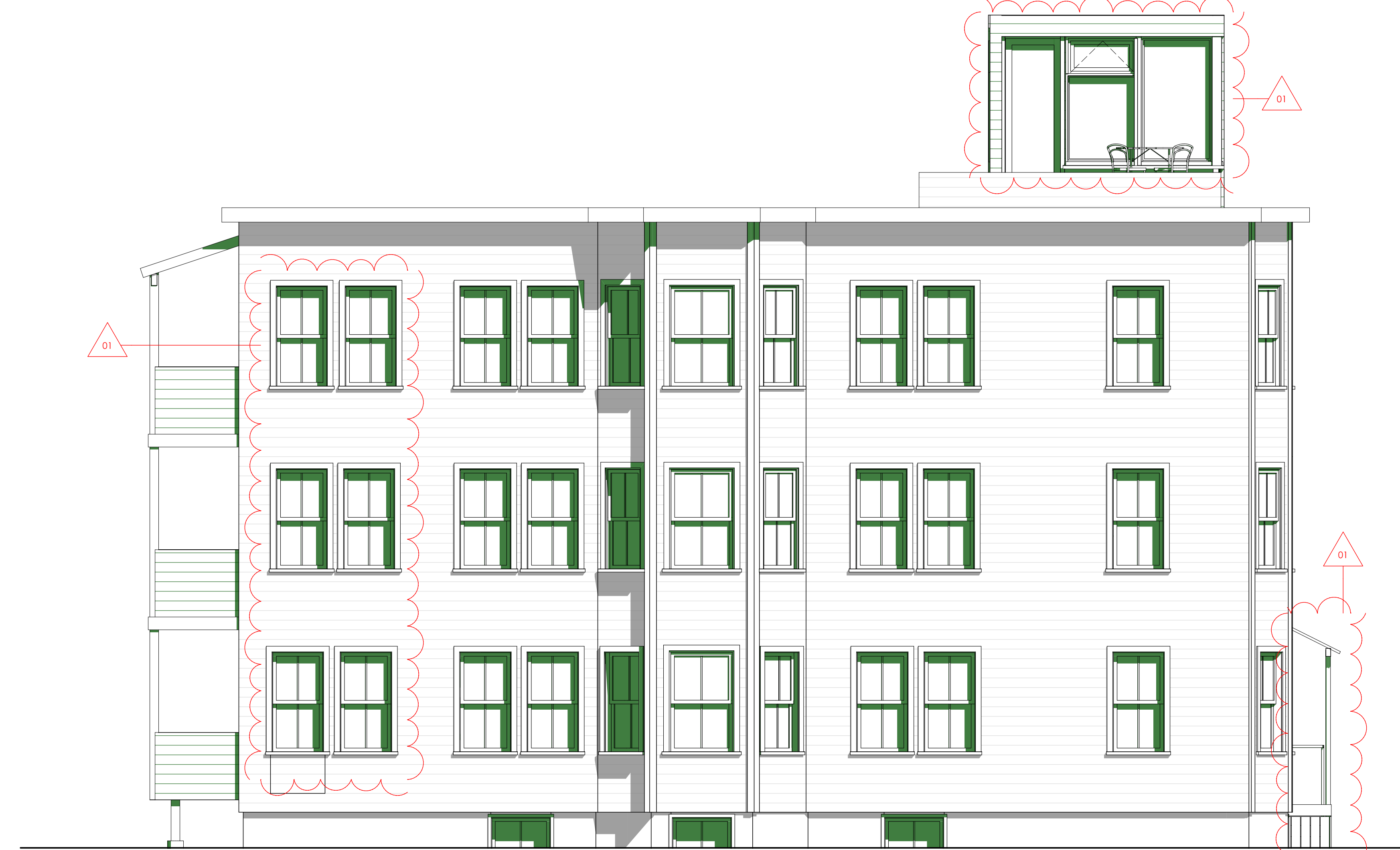
4 EAST ELEVATION SCALE: 1/4" = 1'-0"