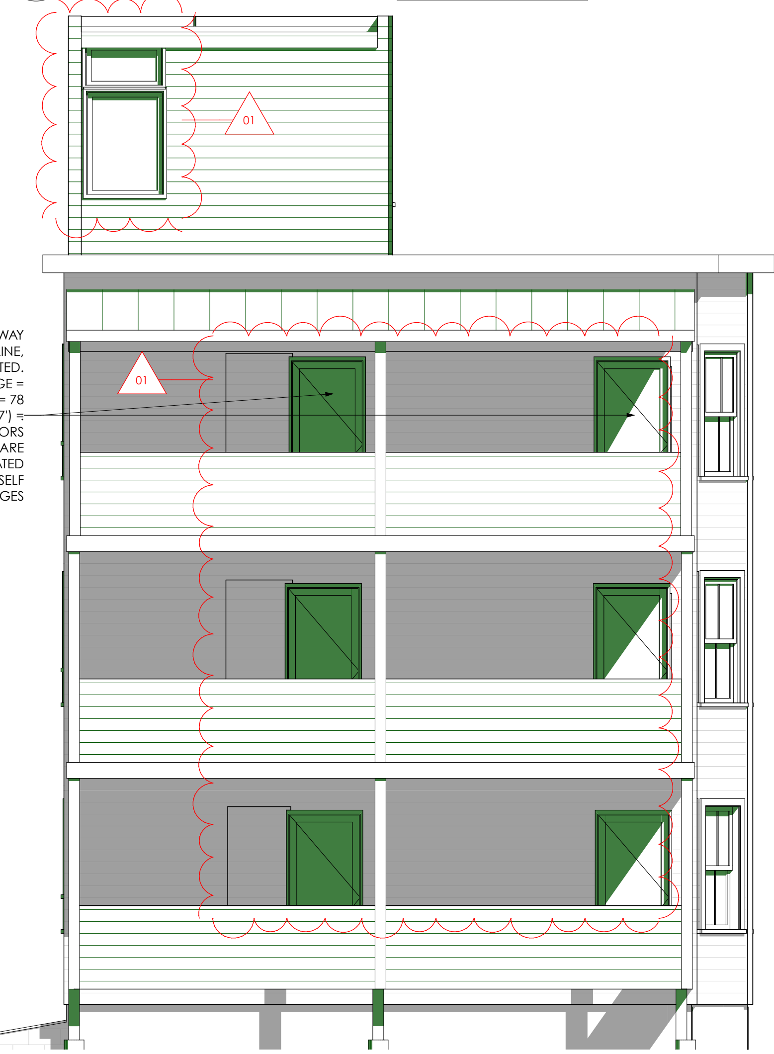
3 SOUTH ELEVATION SCALE: 1/4" = 1'-0"