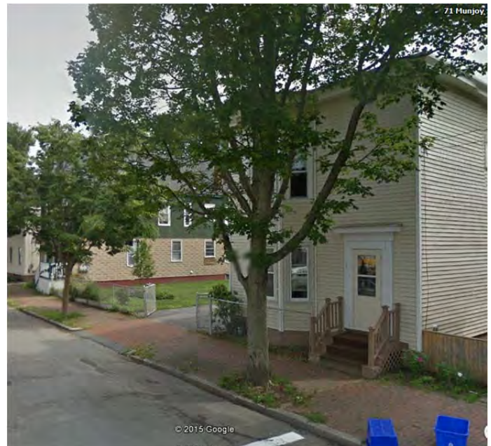
Figures 1 and 2: 68-72 Munjoy Street site from above (left) and from Munjoy Street (right)