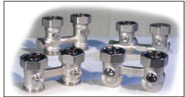
Four different radiator valves are available to make system design, installation and maintenance quick and easy

Pensotti Panel Radiators are quick and easy to install with the supplied snap-in mounting brackets, bottom pipe connections and reversible mounting.