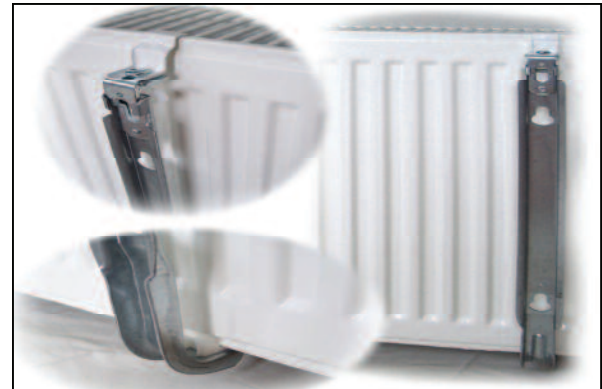
Pensotti Snap-Grip mounting brackets make radiator installation and removal a snap