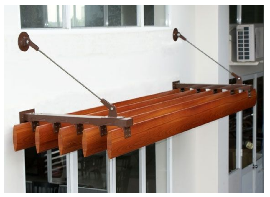
Entry Awning Detail- to be prefabricated and purchased.

*Note: Southeast Elevation = 376sf Glass door = 16.5sf, window = 52.5sf Percent fenestration = 18%