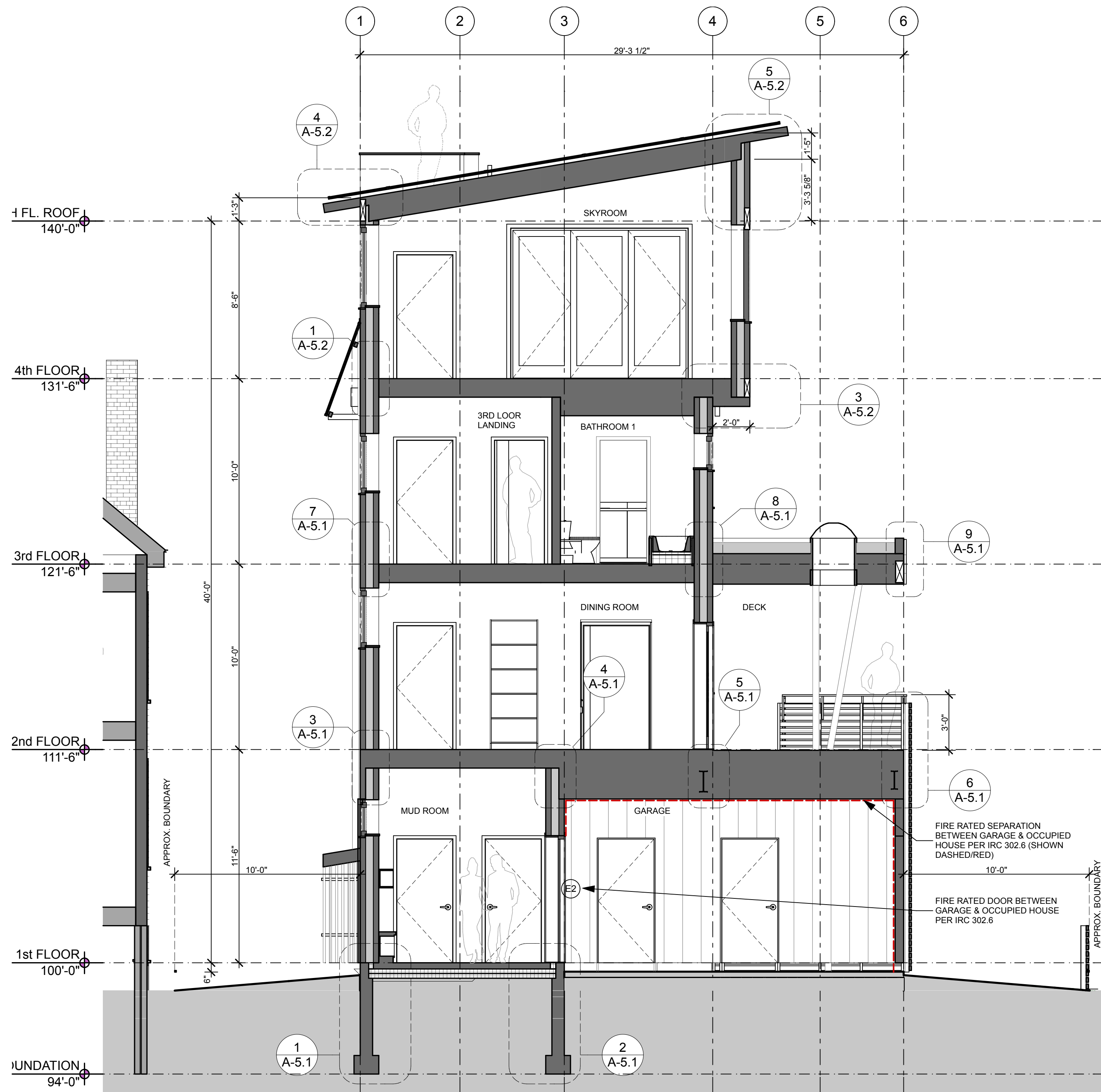
1 SHORT SECTION - AT STAIR LANDING & 2ND FLOOR DECK SCALE: 1/4" = 1'-0"