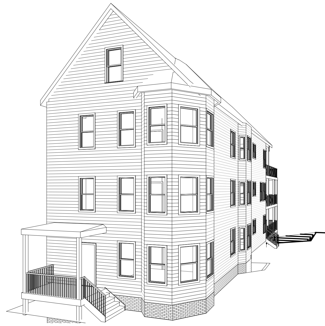
2 View from Street