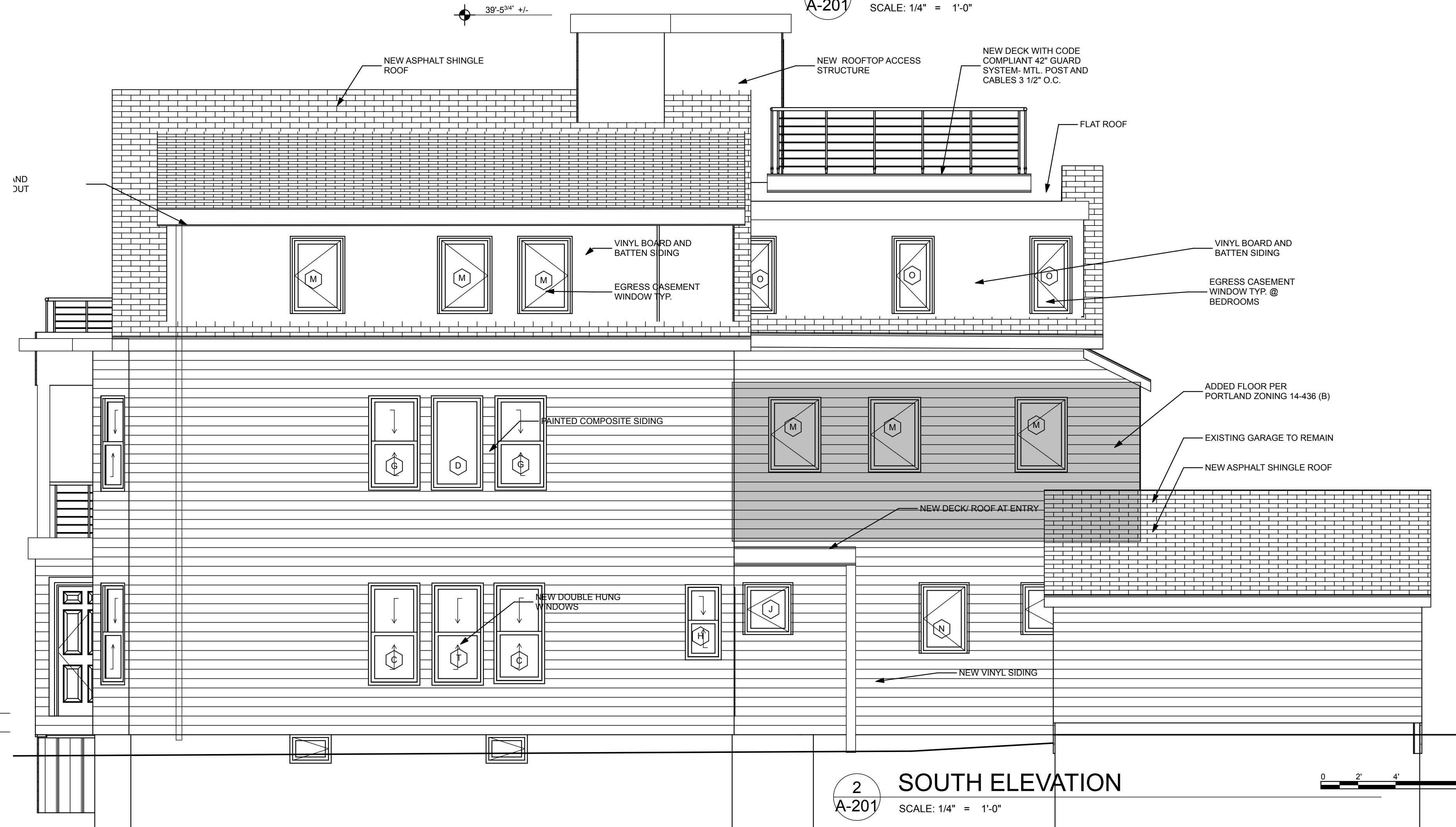
2 SOUTH ELEVATION A-201 SCALE: 1/4" = 1'-0"