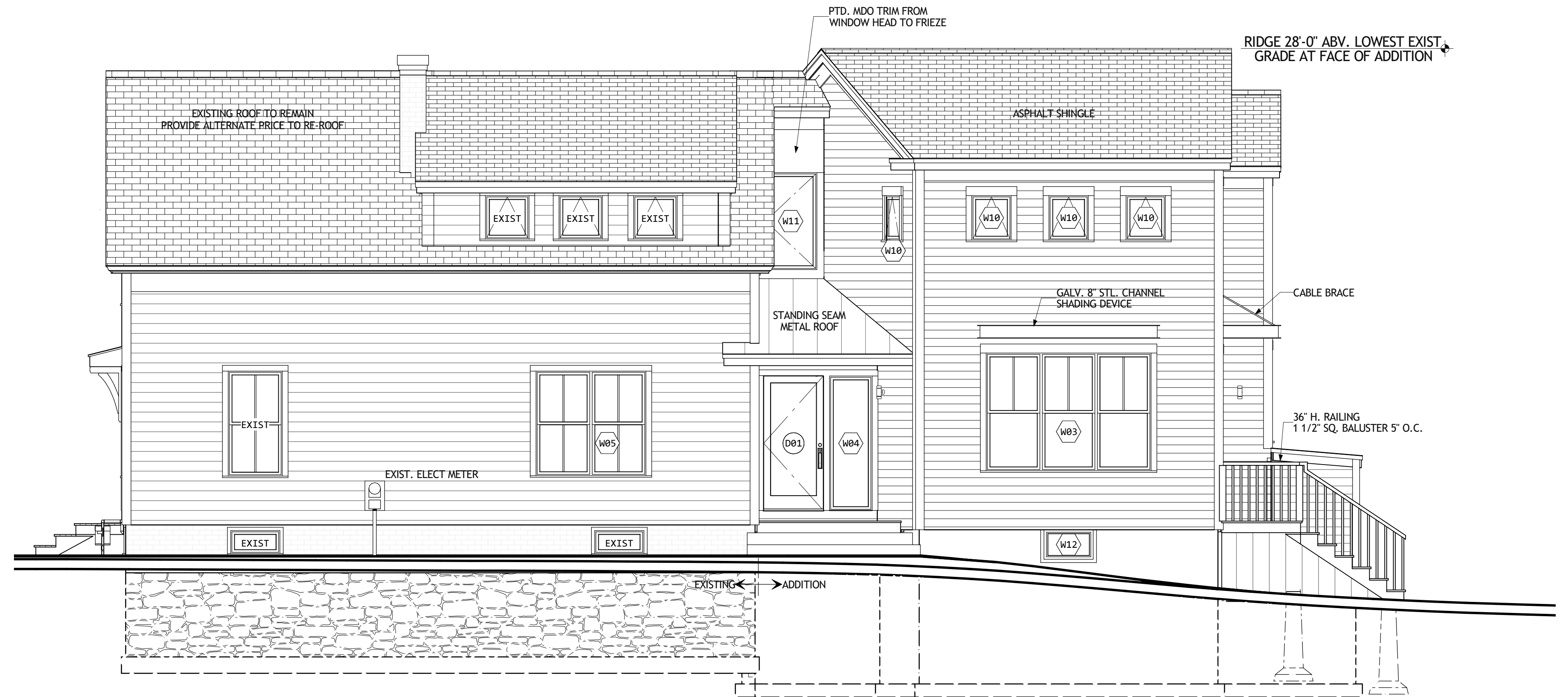
2 South (Right) Elevation A2.1 SCALE: 1/4" = 1' - 0"