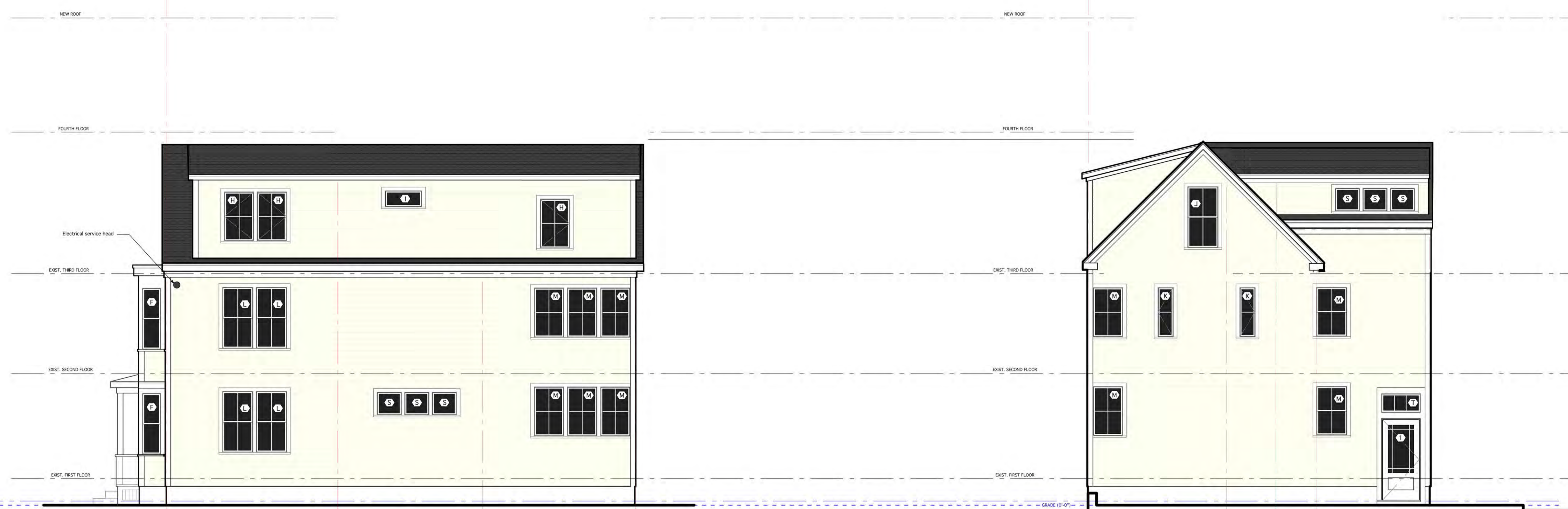
SCHEMATIC ELEVATION - NORTH