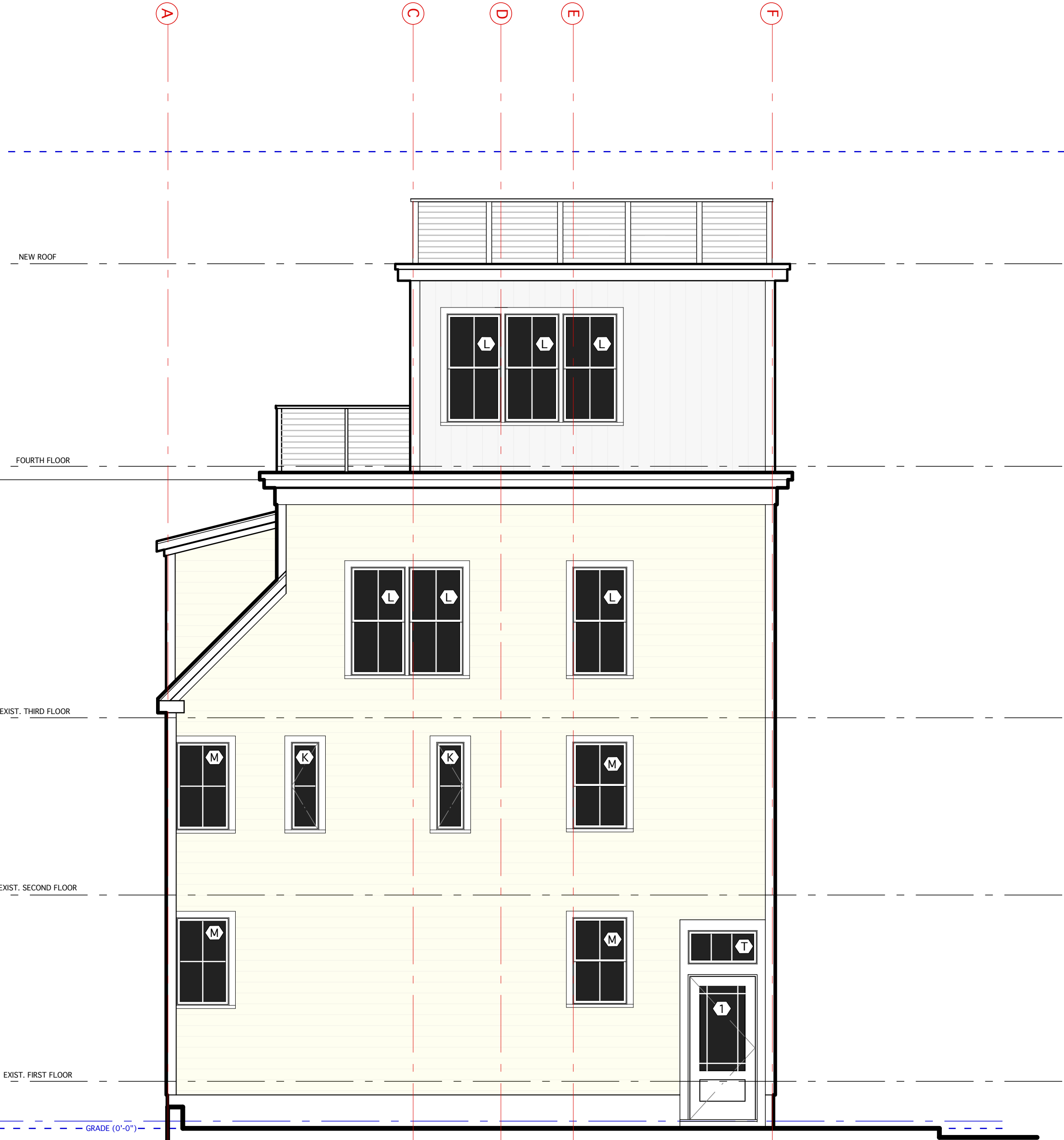
PROPOSED ELEVATION - WEST