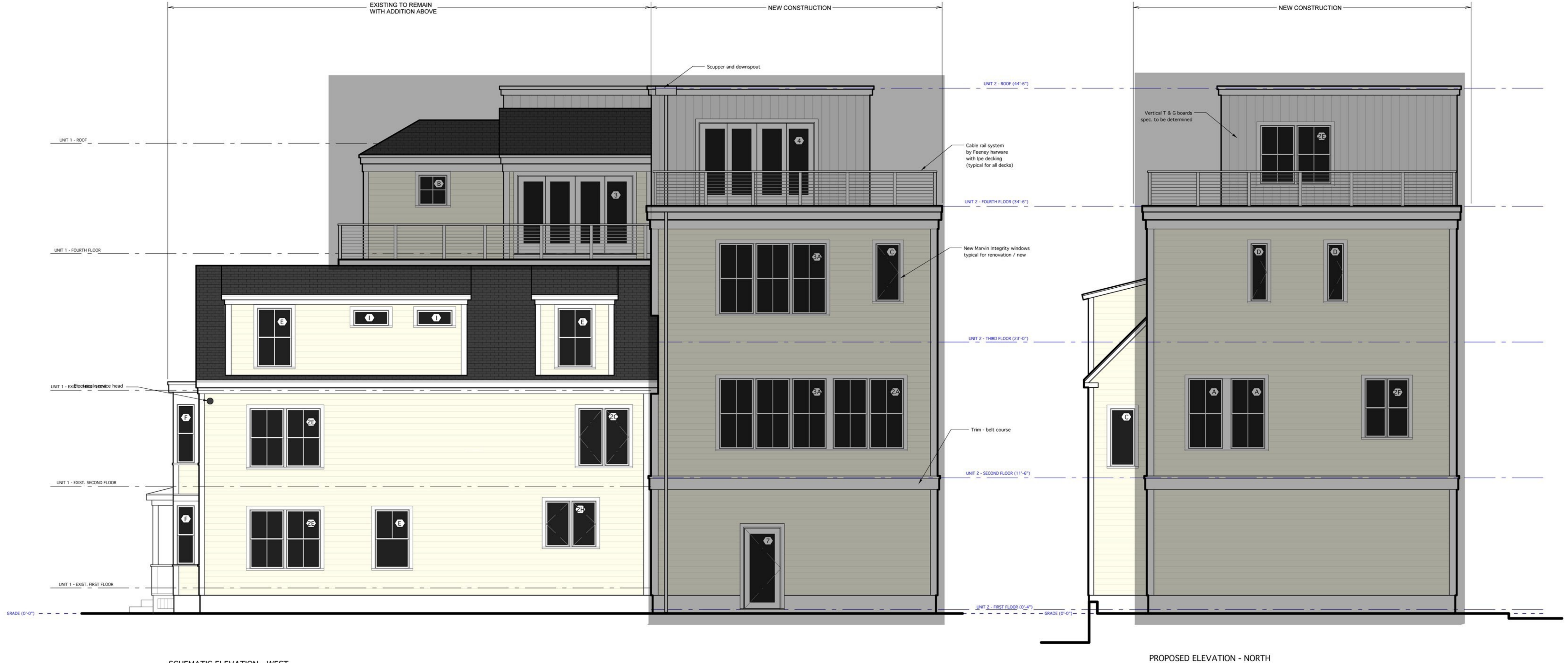
SCHEMATIC ELEVATION - WEST