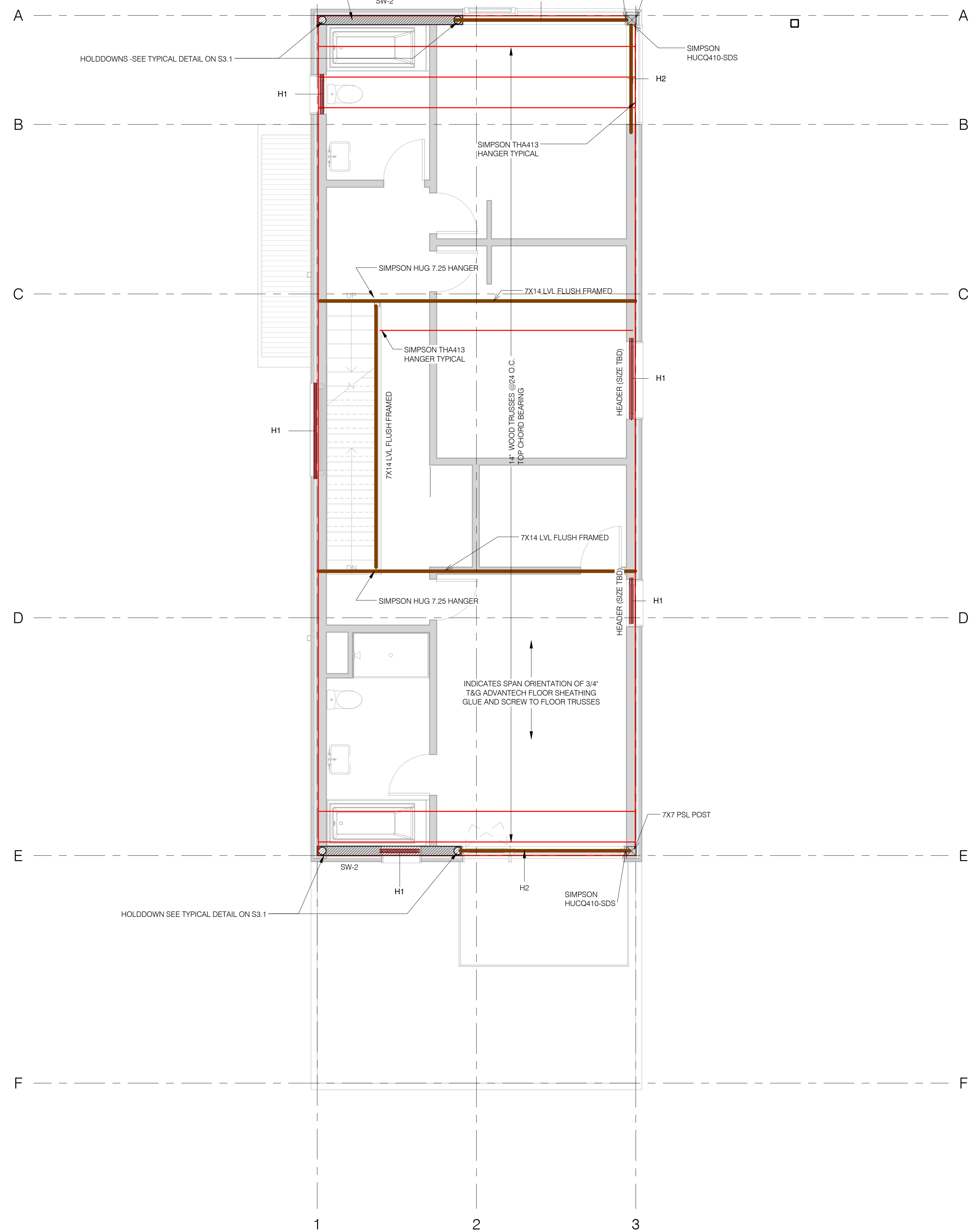
2 Third Floor Framing Over Second Floor 1/4" = 1'-0"