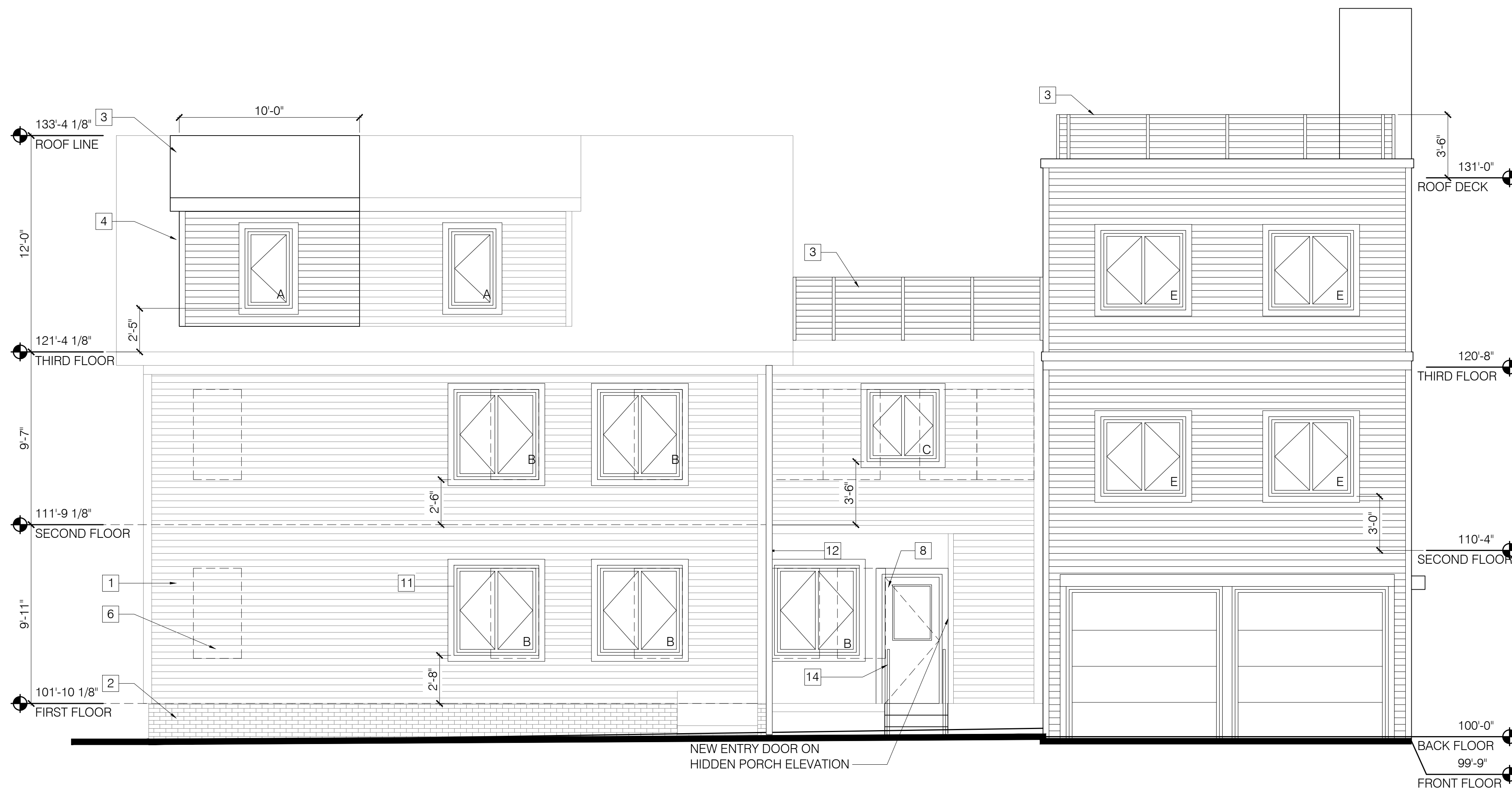
1 SOUTH ELEVATION SCALE: 1/8" = 1'-0"