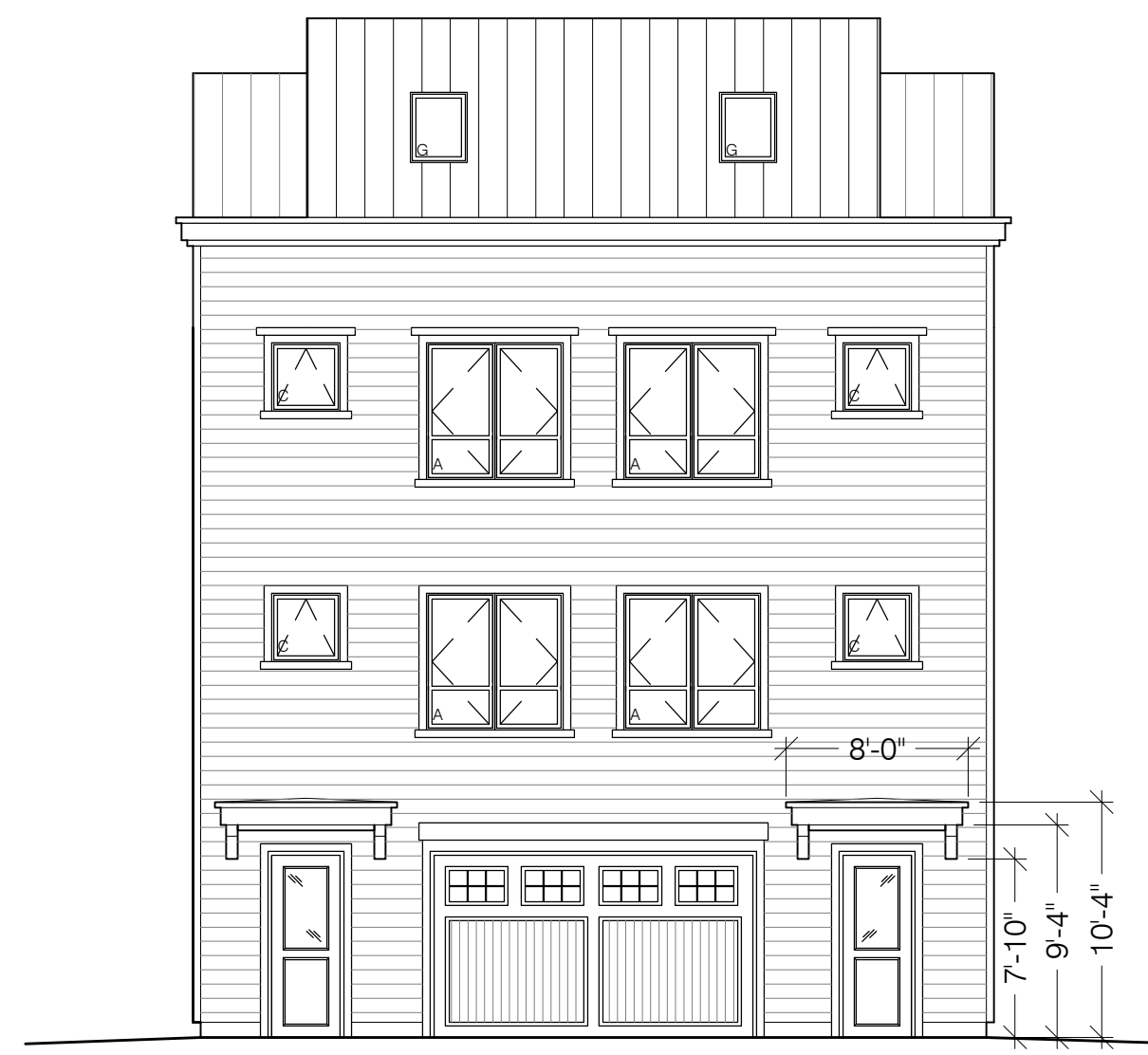
1 SOUTH ELEVATION 0 8'-0" SCALE: 1/8" = 1'-0"