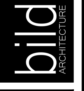
Bild Architecture PO Box 8235 Portland, ME 04104 207.408.0168 evan@bildarchitecture.com