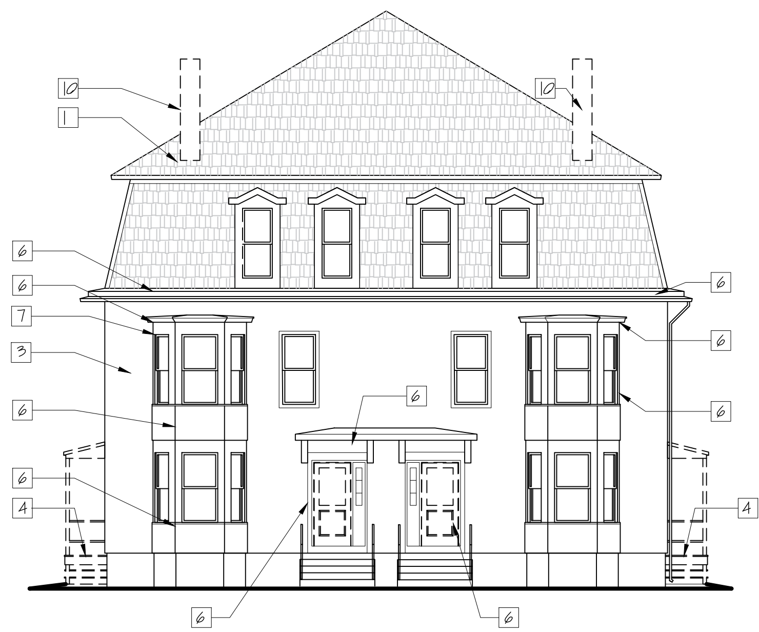
4 SOUTH ELEVATION 0 8'-0" SCALE: 1/8" = 1'-0"